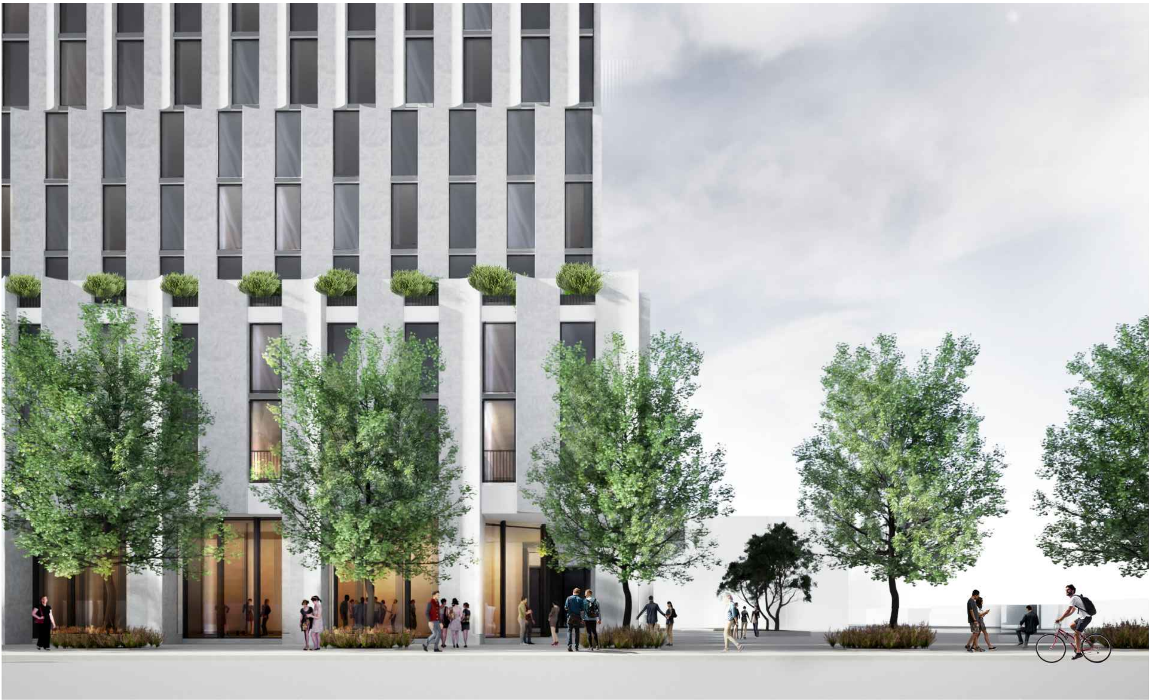
SOUTH EAST CORNER OF BUILDING - VIEW FROM DUNDAS ST. W.