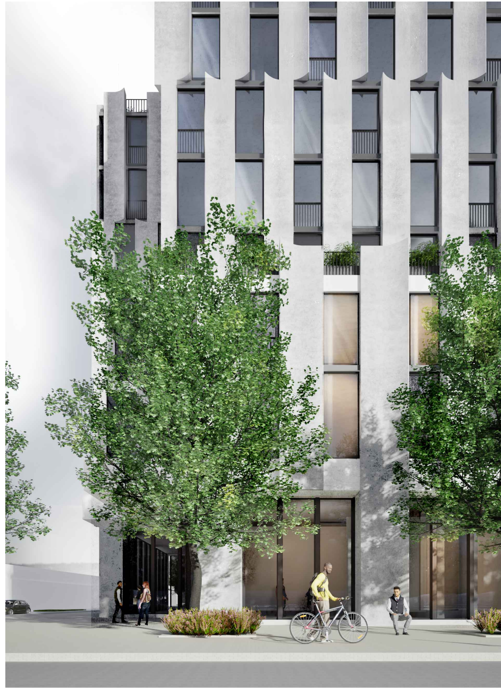
NORTH WEST CORNER VIEW FROM DUNDAS ST. W. AT NEW PUBLIC ROAD AND PLAZA