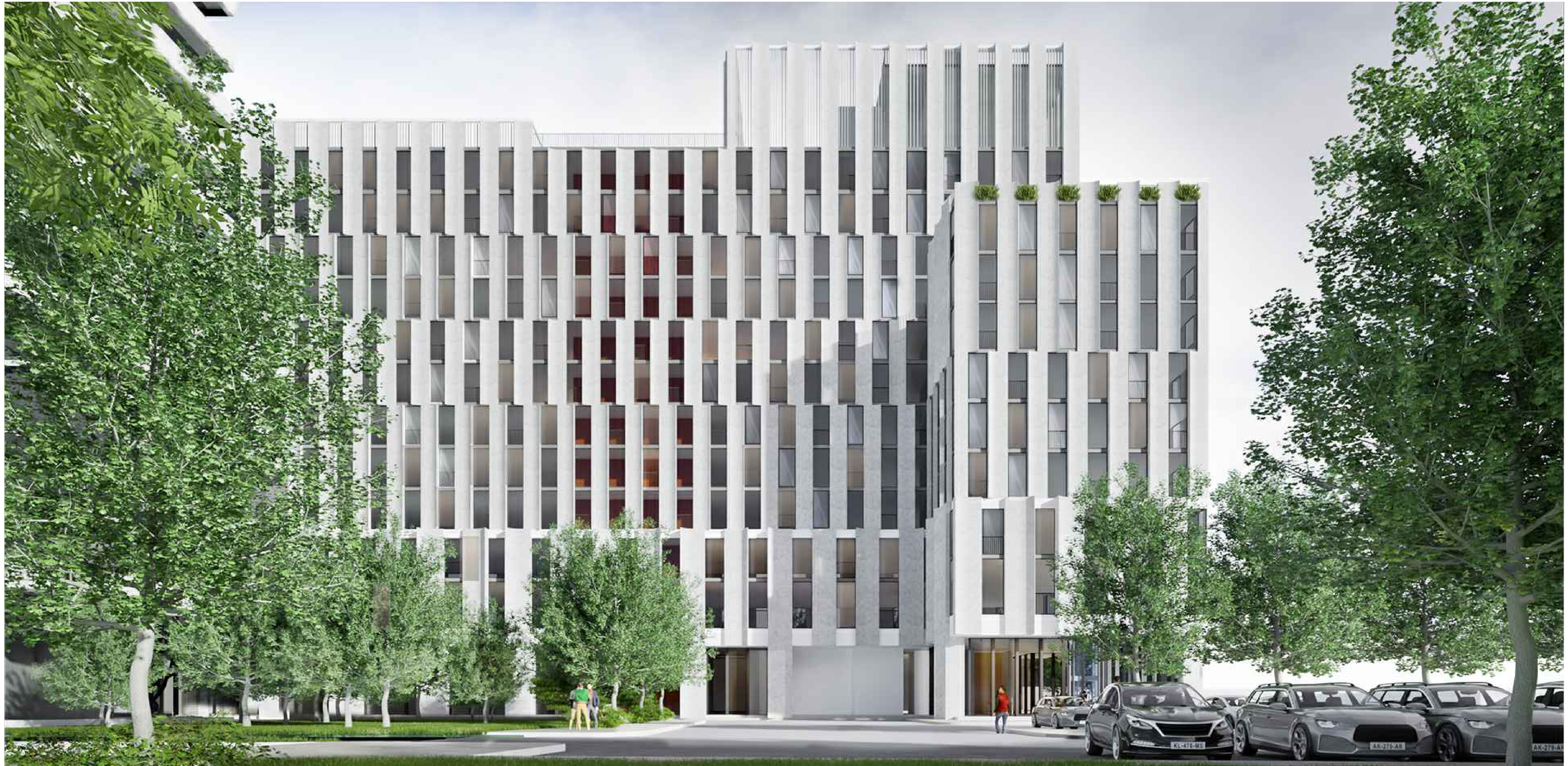
NORTH ELEVATION VIEW FROM PARKING AND OUTDOOR AMENITIES

Note: This drawing is the property of the Architect and may not be reproduced or used without the expressed consent of the Architect. The Contractor is responsible for checking and verifying all levels and dimensions and shall report all discrepancies to the Architect and obtain clarification prior to commencing work.