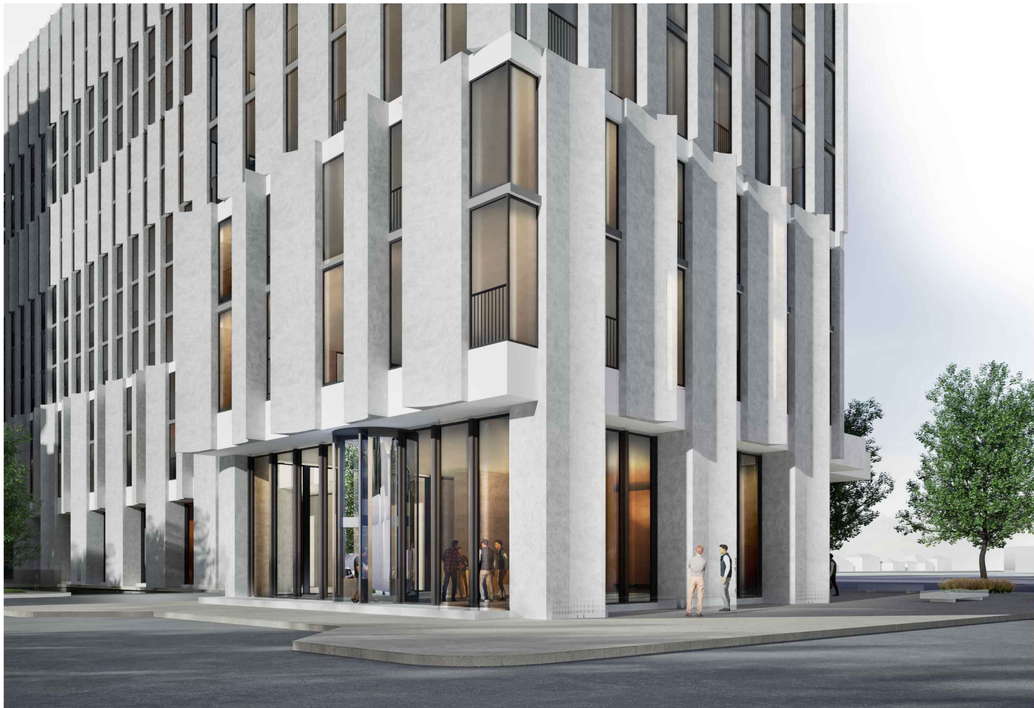
NORTH WEST CORNER SHOWING NORTH ENTRANCE TO MEDICAL CENTER