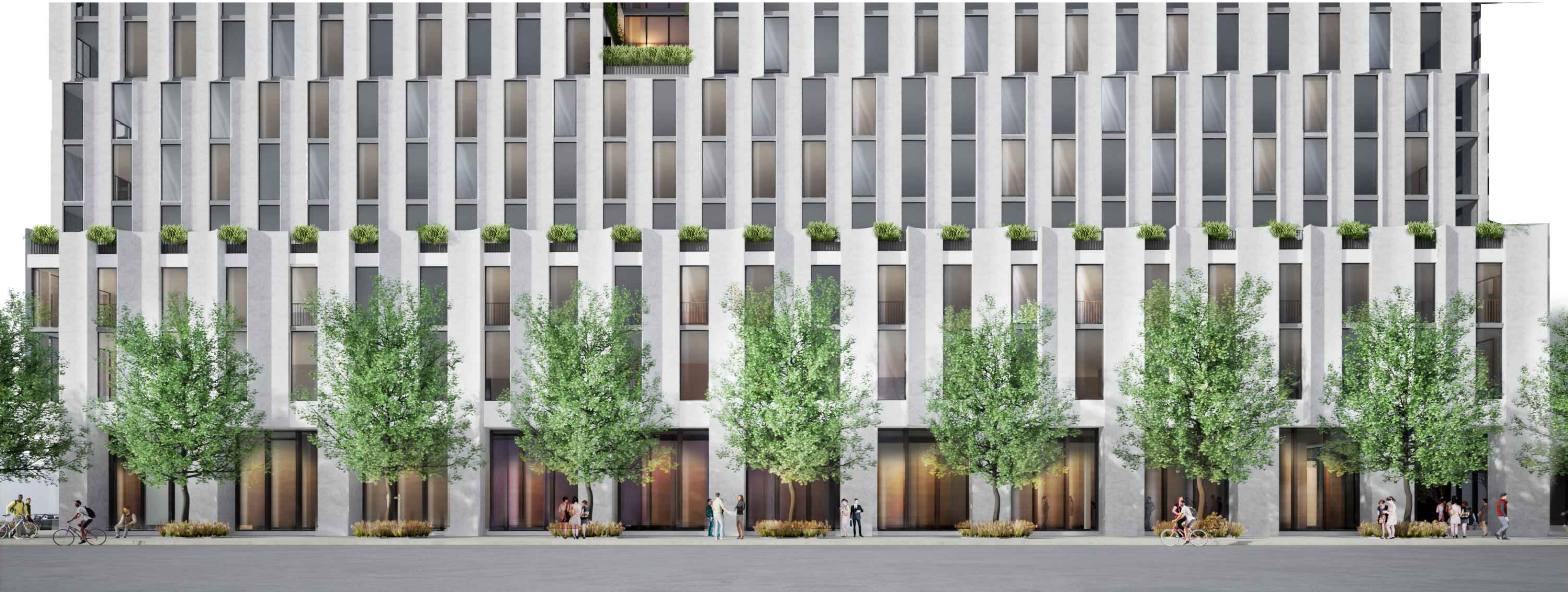
SOUTH ELEVATION PODIUM VIEW FROM DUNDAS ST. W.

131 Bloor Street West, Toronto Ontario, M5S 1S3 www.hout.ca office@hout.ca