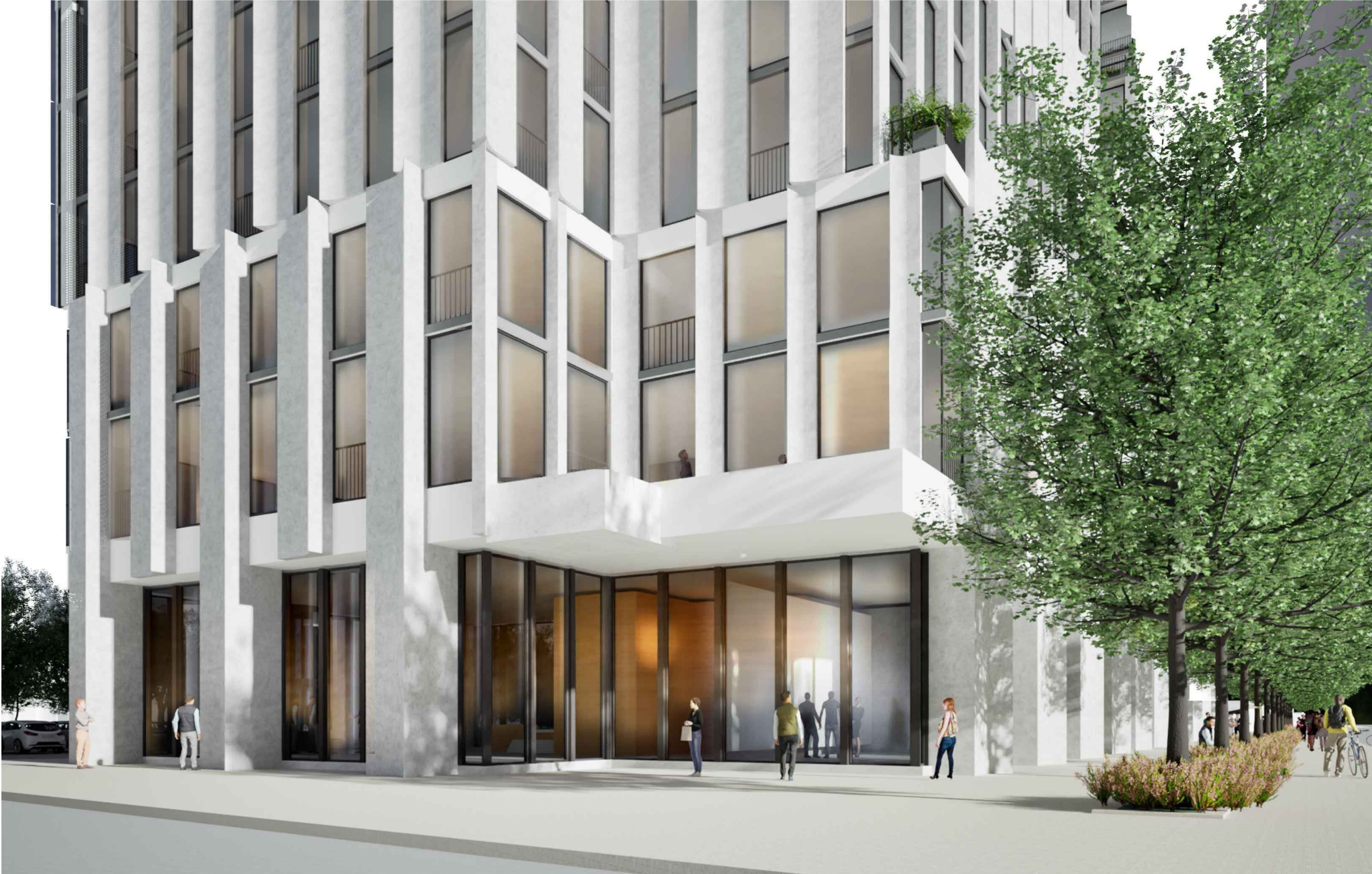
WEST SIDE OF BUILDING AT PLAZA AND MEDICAL CENTER