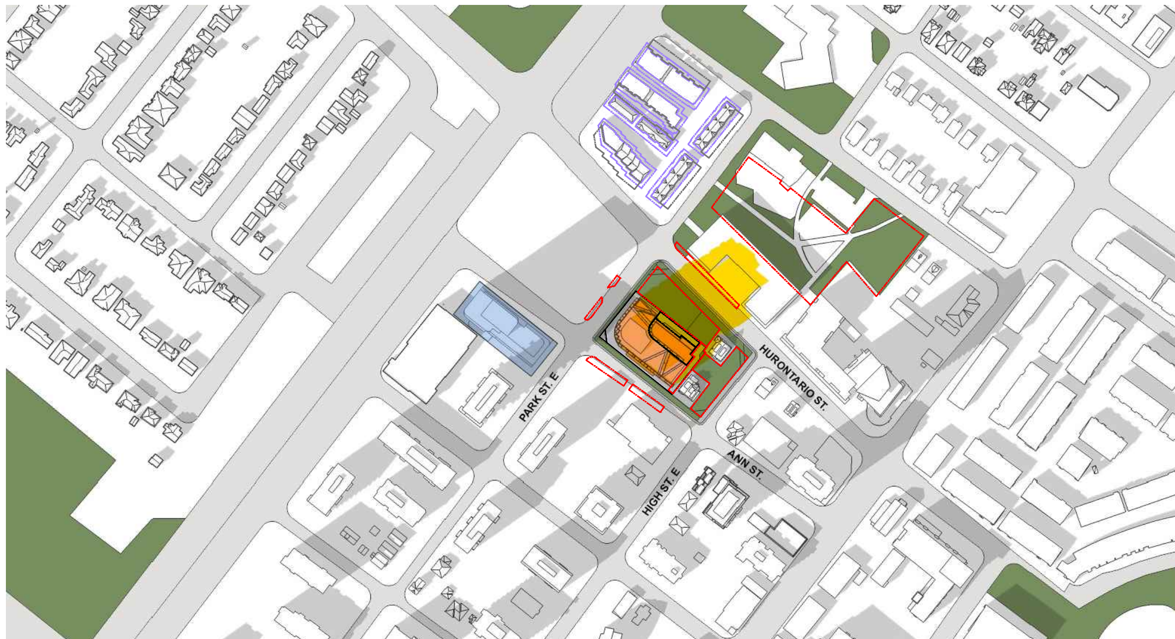
SEPTEMBER / MARCH 21, 16:12