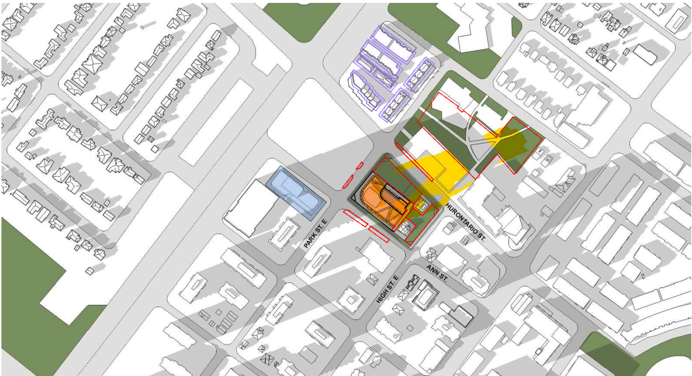
SEPTEMBER / MARCH 21, 17:12