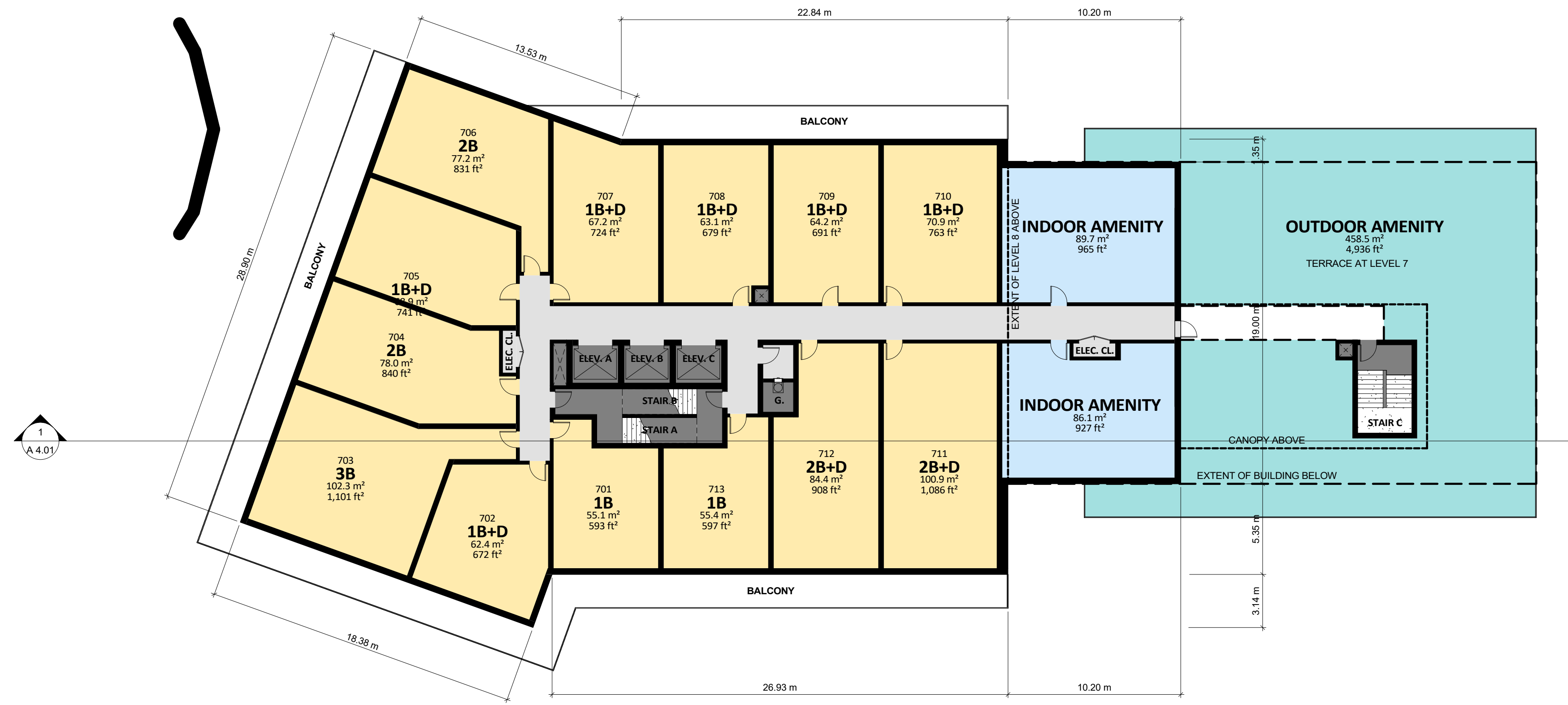
① LEVEL 7 1 : 200