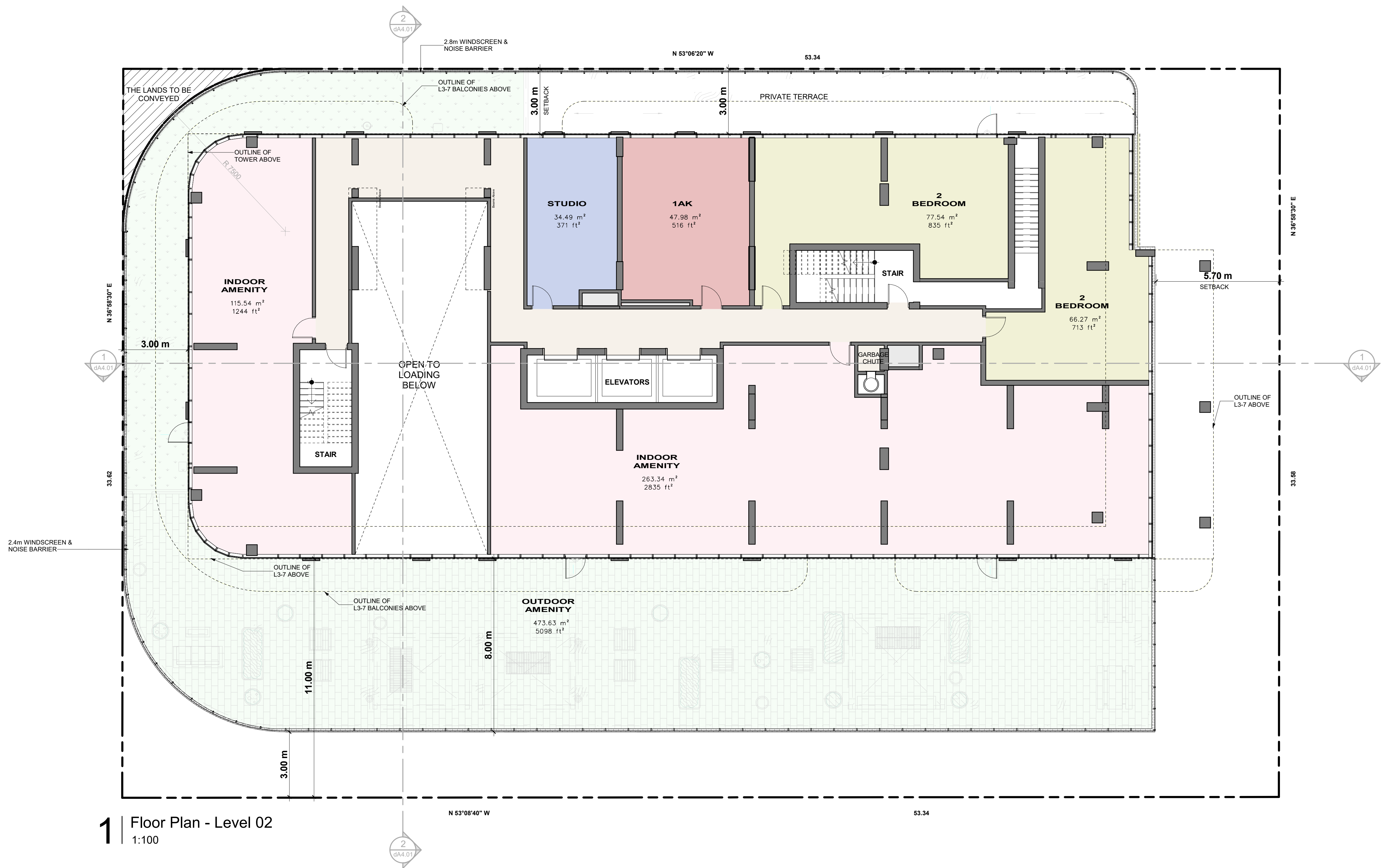
1 | Floor Plan - Level 02

All Drawings, Specifications, and Related Documents are the Copyright of the Architect. The Architect retains all rights to control all uses of these documents for the intended issuance/use as identified below. Reproduction of these Documents, without permission from the Architect, is strictly prohibited. The Authorities Having Jurisdiction are permitted to use, distribute, and reproduce these drawings for the intended issuance as noted and dated below, however the extended permission to the Authorities Having Jurisdiction in no way debases or limits the Copyright of the Architect, or control of use of these documents by the Architect.