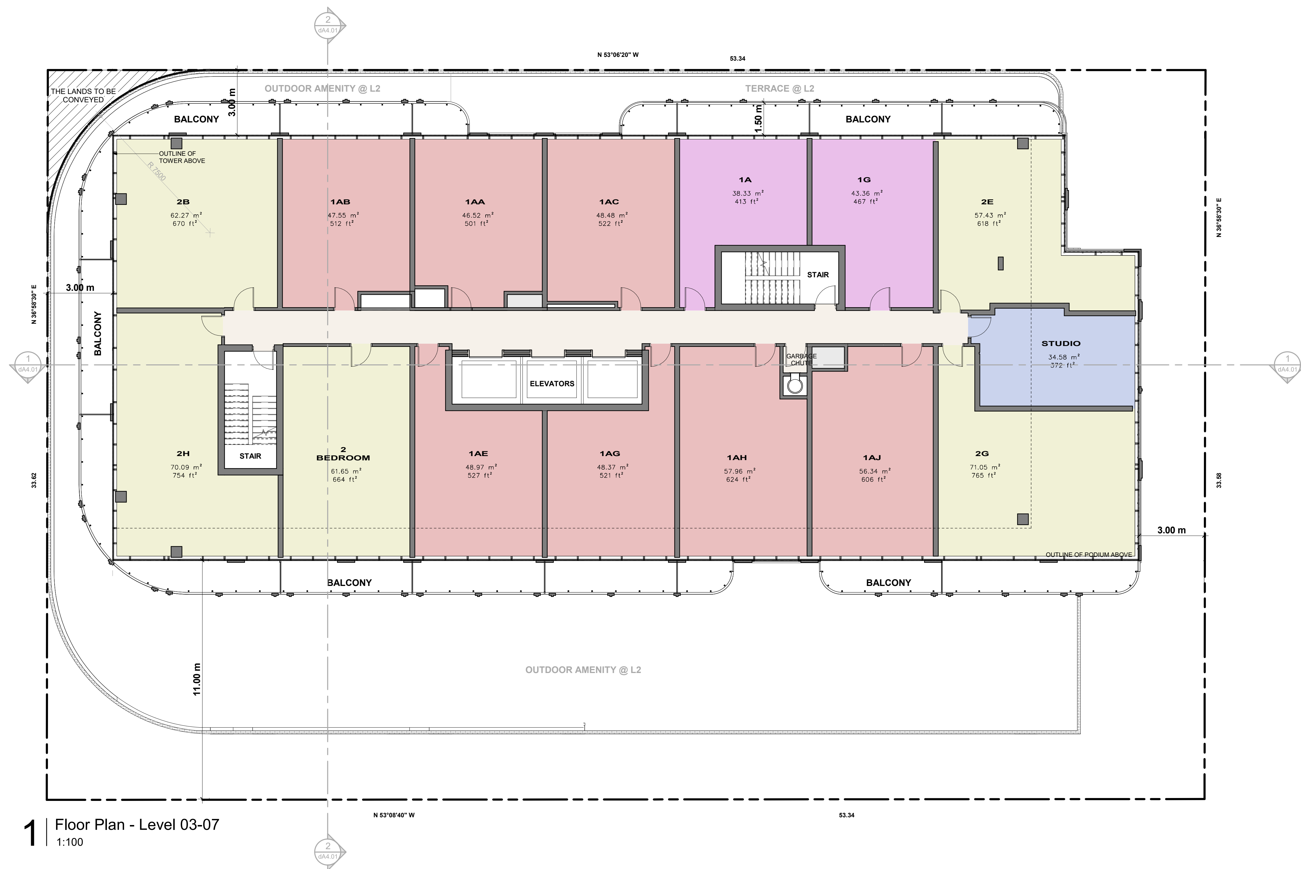
1 | Floor Plan - Level 03-07