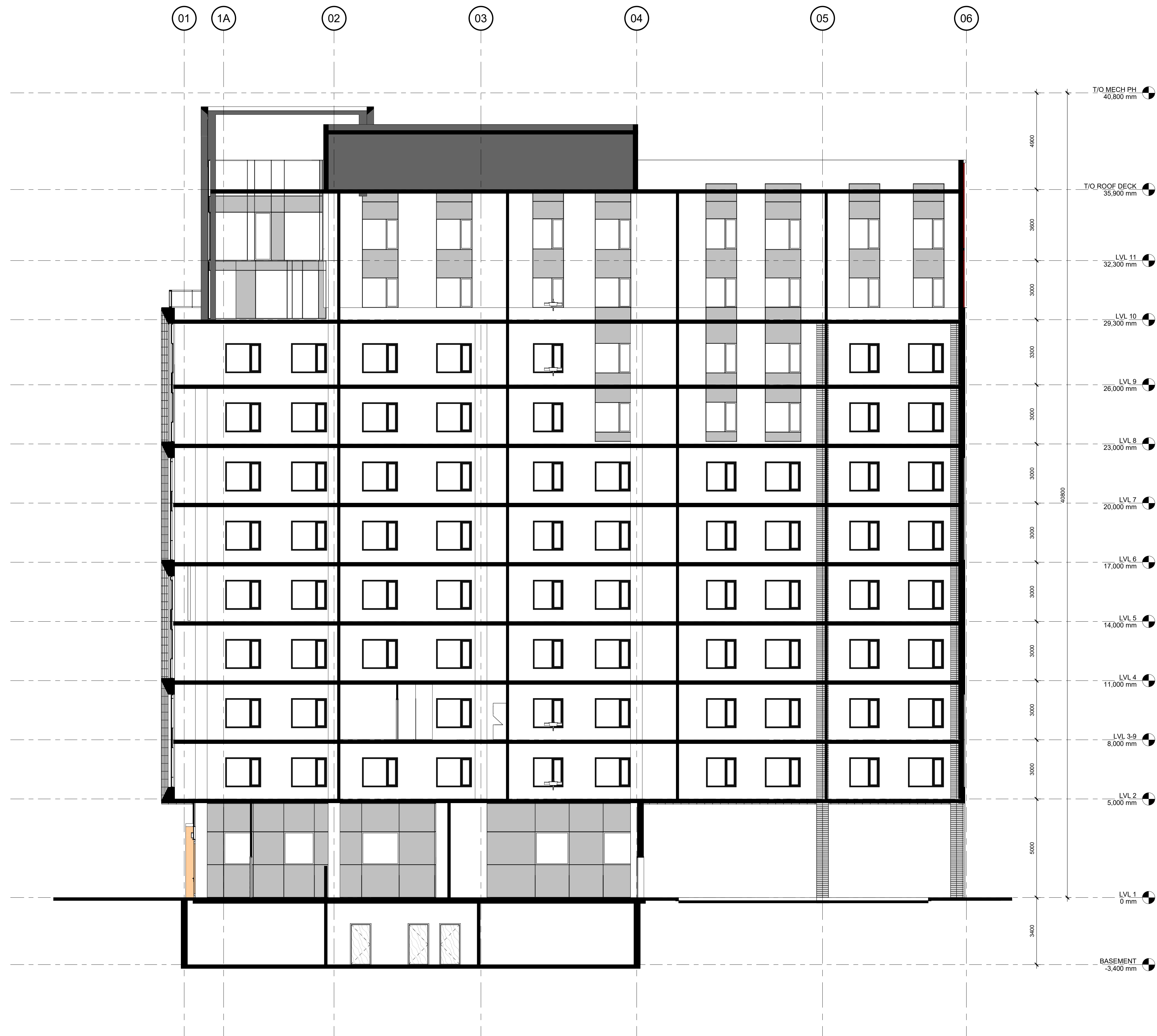
1 BUILDING SECTION I A301 1 : 100