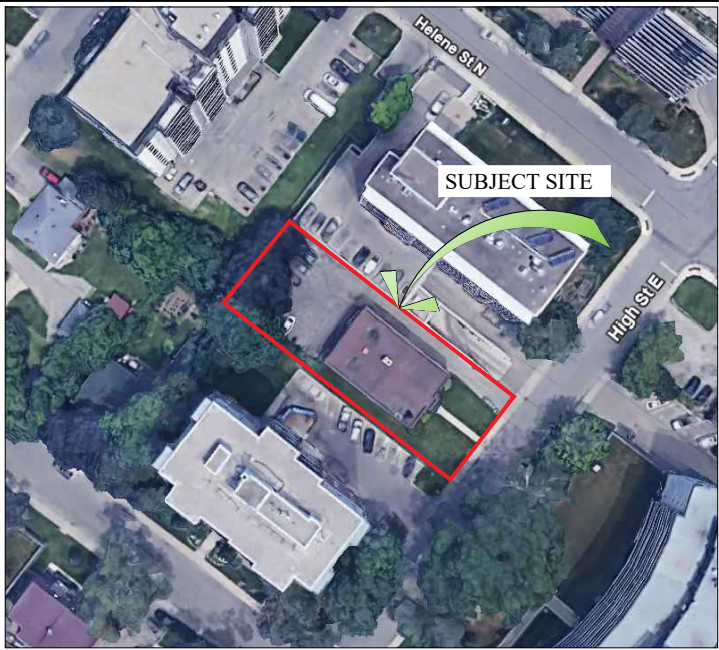
KEY MAP N.T.S.

CONTRACTOR IS RESPONSIBLE FOR ALL LOCATES INCLUDING ALL UNDERGROUND SERVICES PRIOR TO ANY EXCAVATION OR INSTALLATIONS. THE CONTRACTOR IS REQUIRED TO NOTIFY THE VARIOUS UTILITY COMPANIES 48 HOURS PRIOR TO THE COMMENCEMENT OF ANY WORK.