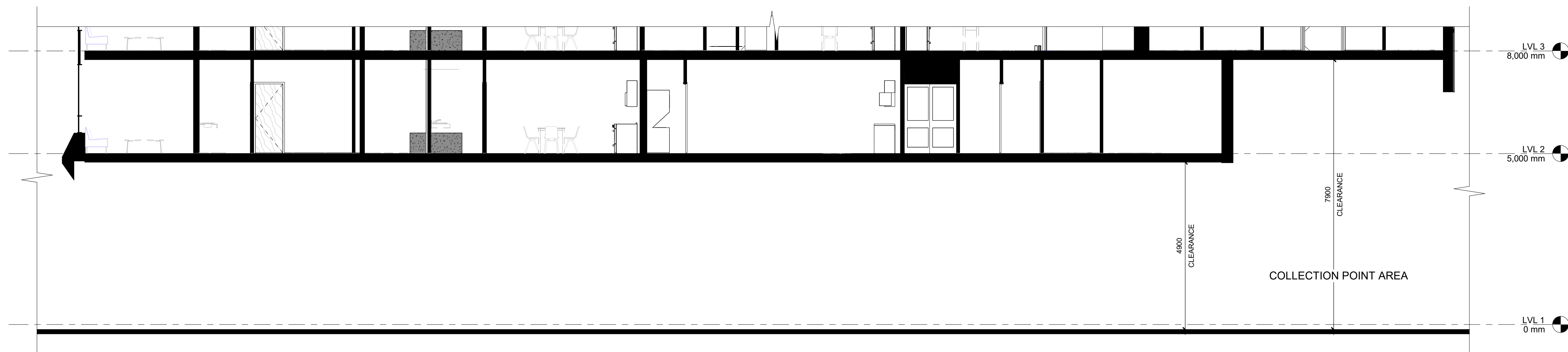
3 WASTE COLLECTION VEHICLE'S ACCESS AND EGRESS ROUTE CROSS SECTION A104 1: 75