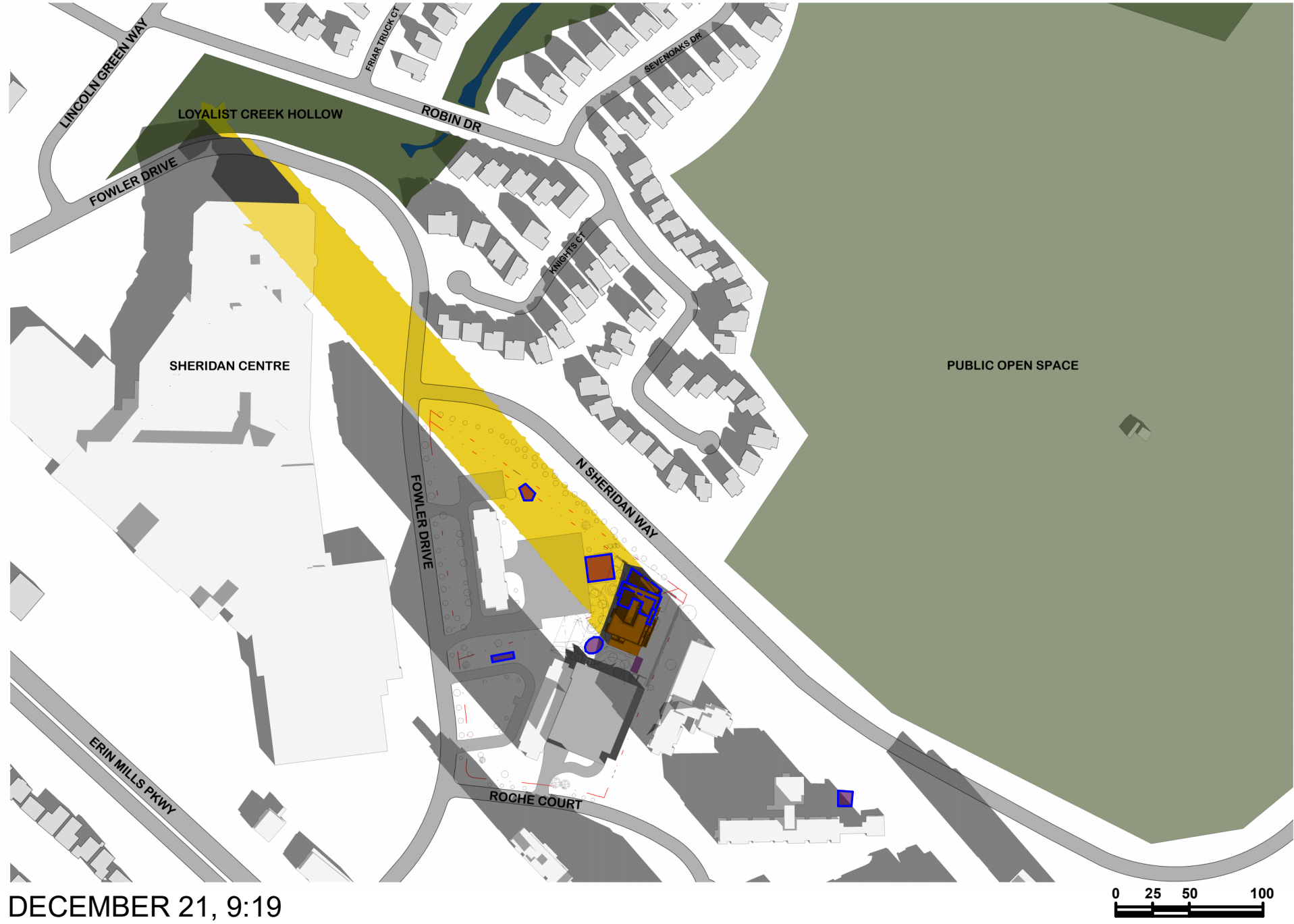
DECEMBER 21, 9:19