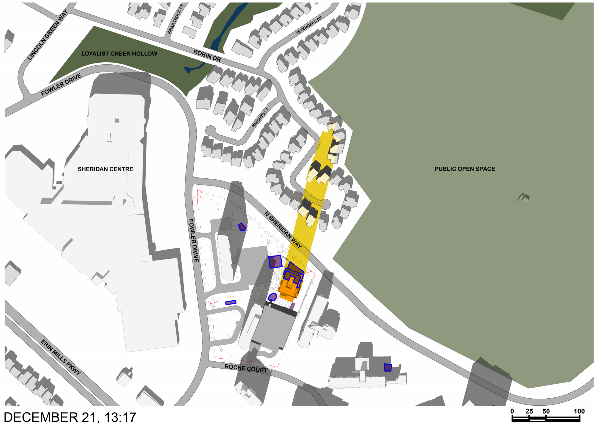
DECEMBER 21, 13:17