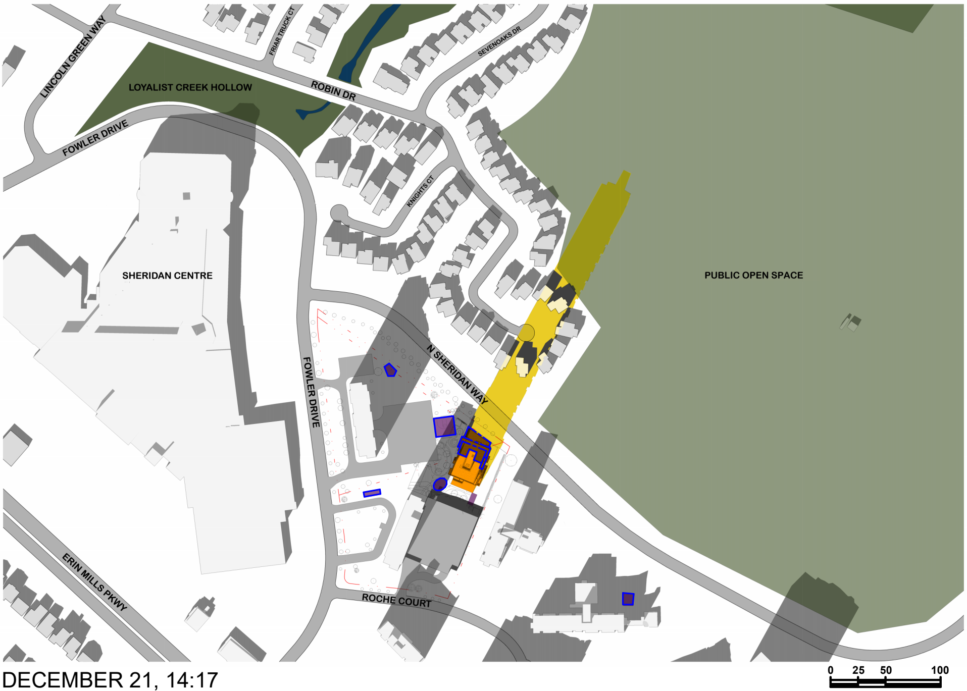
DECEMBER 21, 14:17