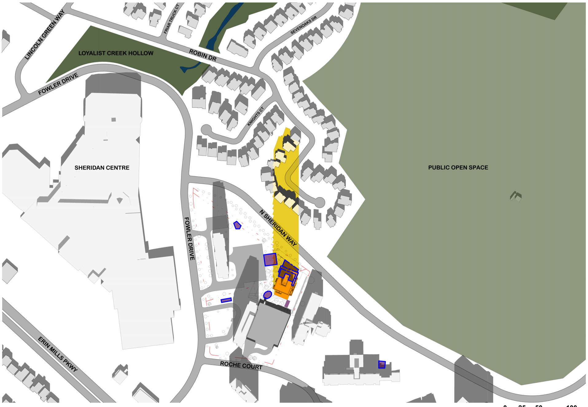
DECEMBER 21, 12:17