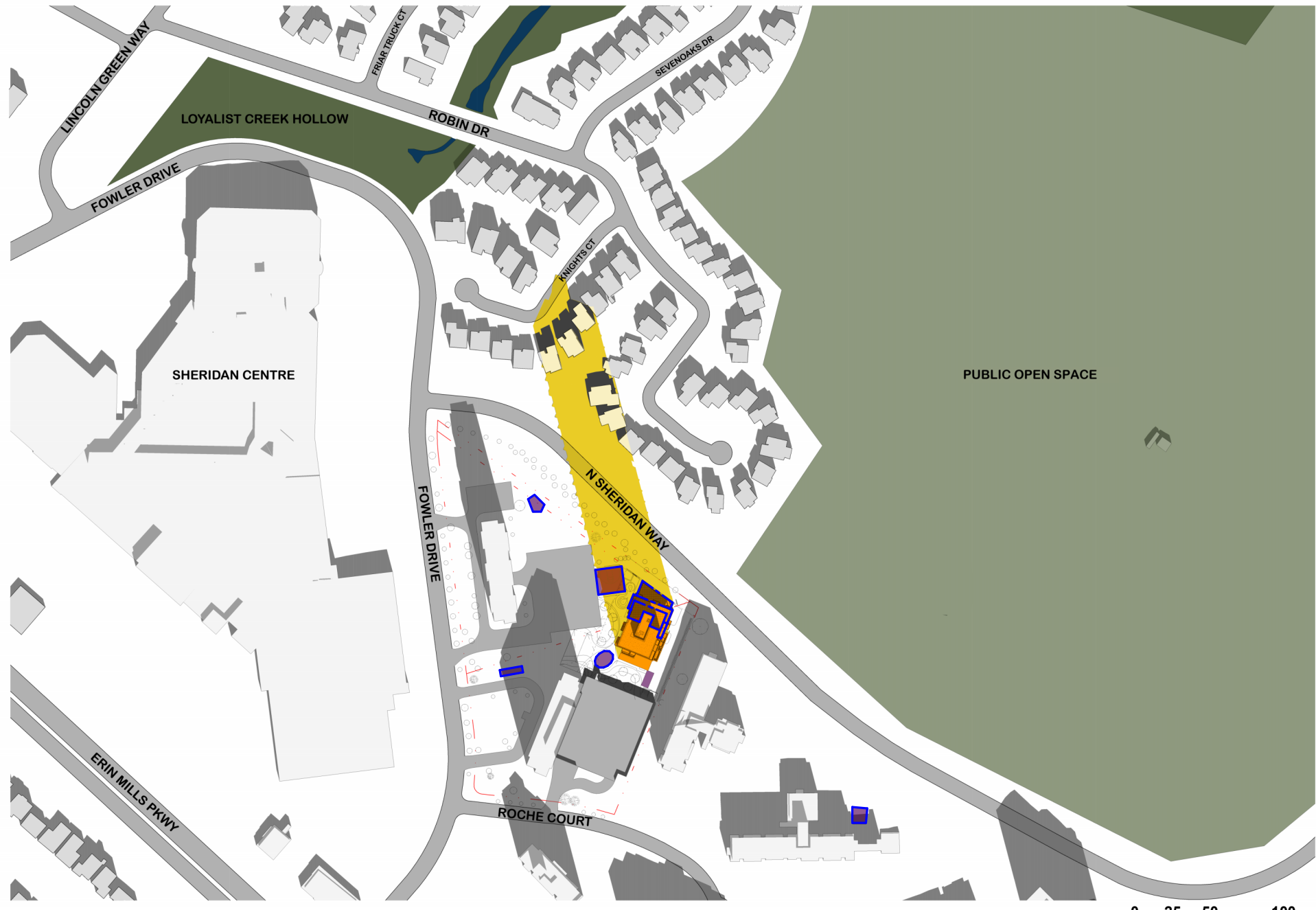
DECEMBER 21, 11:17