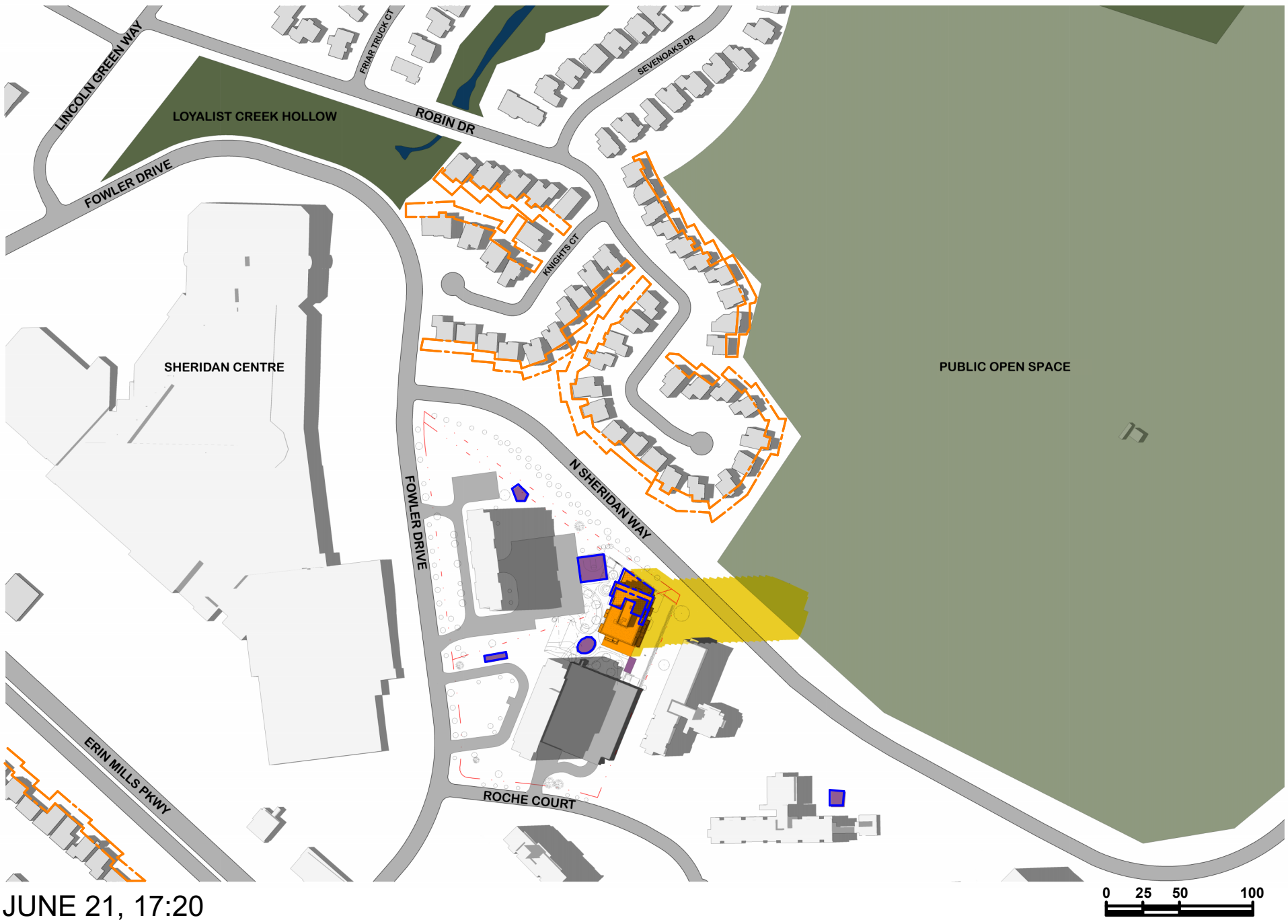
JUNE 21, 17:20