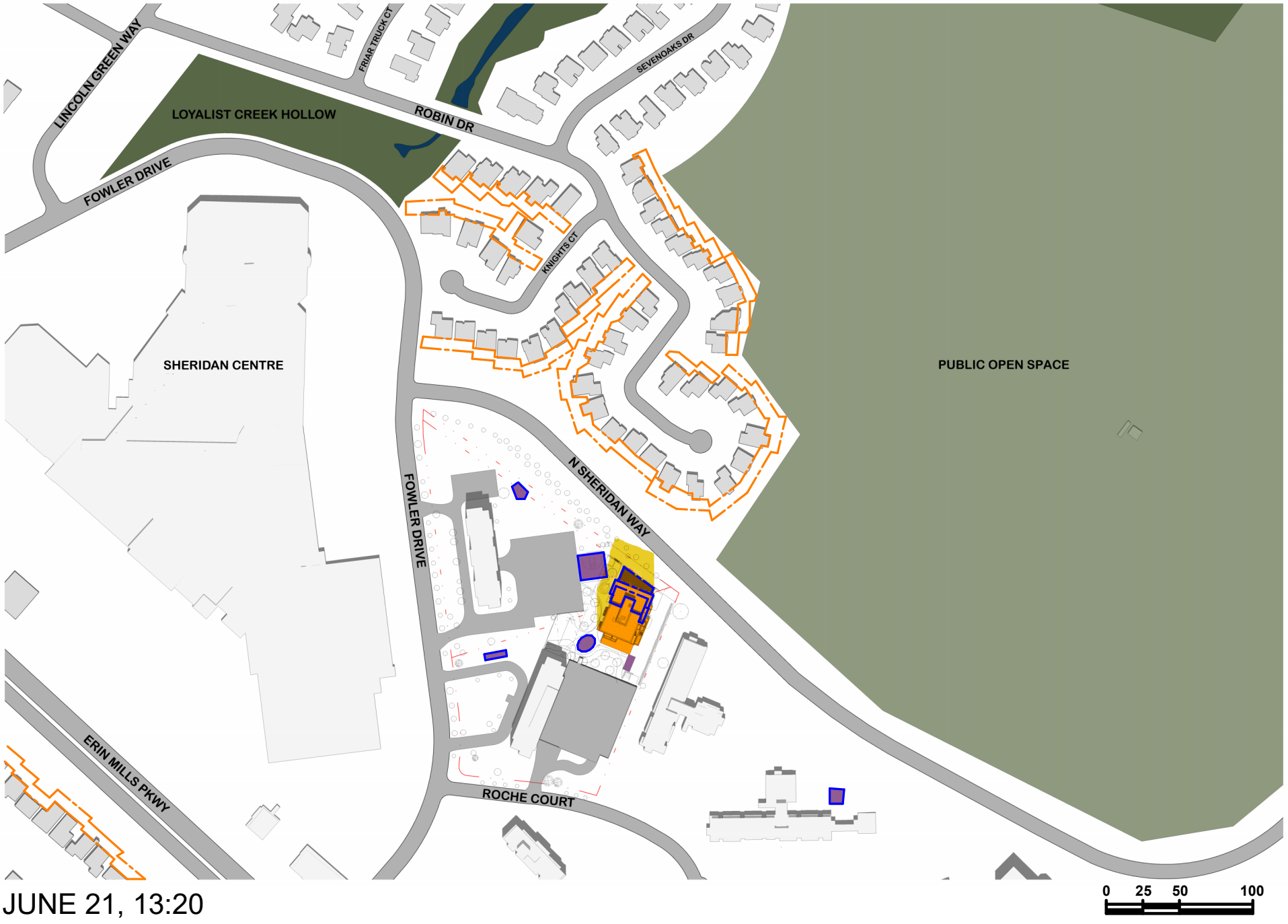
JUNE 21, 13:20