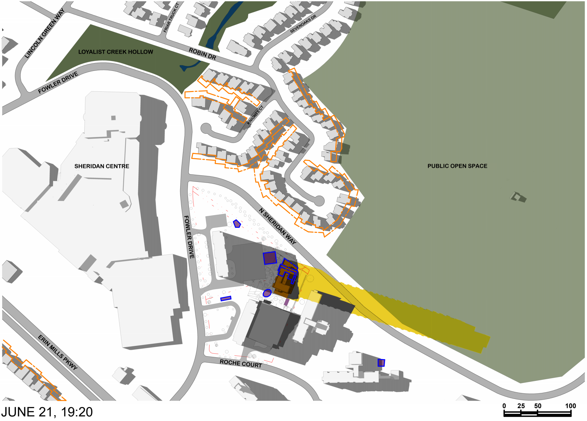
JUNE 21, 19:20