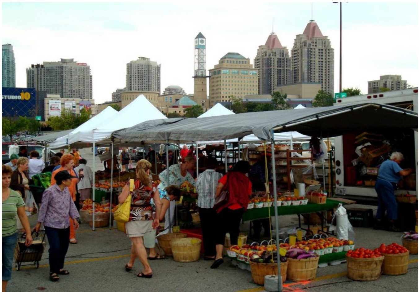
Figure 1-1: Formed in 1974, Mississauga is recognized as Canada's sixth largest city and Ontario's third largest city, with a population of over 730,000 residents representing cultures from around the world. Mississauga has many attractions and events that run at various times throughout the year. The Downtown is a central spot for activities, including the Farmers' Market.

Mississauga Official Plan provides a new policy framework to protect, enhance, restore and expand the Natural Heritage System, to direct growth to where it will benefit the urban form, support a strong public transportation system, and address the long term sustainability of the city. Mississauga Official Plan will be an important instrument in city building. All change within the urban environment will be considered for its capacity to create successful places where people, businesses and the natural environment will collectively thrive.