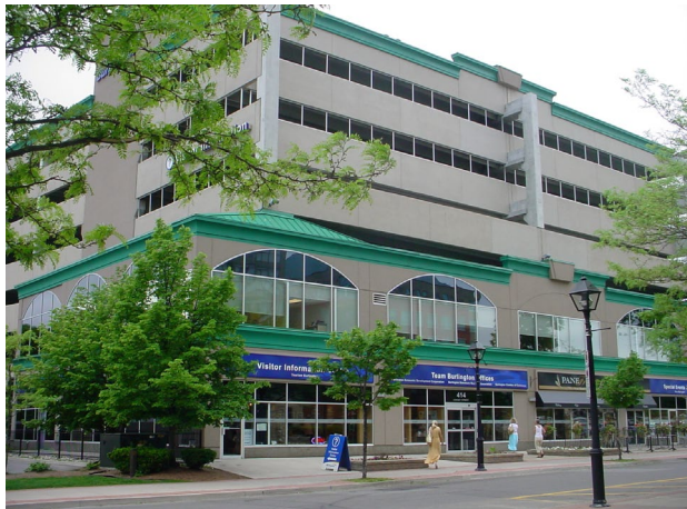
Figure 8-7: Parking garages are a better use of space than surface parking and provide an opportunity to incorporate a mix of uses, as this parking garage in Burlington illustrates.

In other parts of the city, while some changes to parking provisions may occur, sufficient parking should be provided to ensure that the established residential character of Neighbourhoods and the economic function of employment uses is not adversely affected.