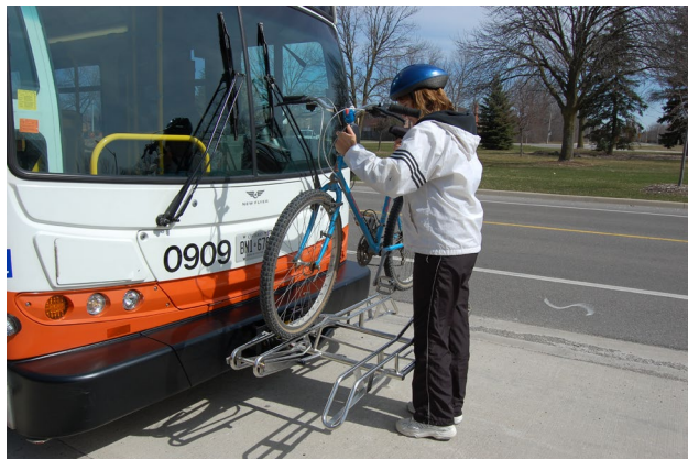
Figure 8-6: People often use multiple modes of transportation in their daily commute. Supplying bike racks on buses is one example of how Mississauga supports cycling.

8.2.4.2 Mississauga will protect and may acquire the