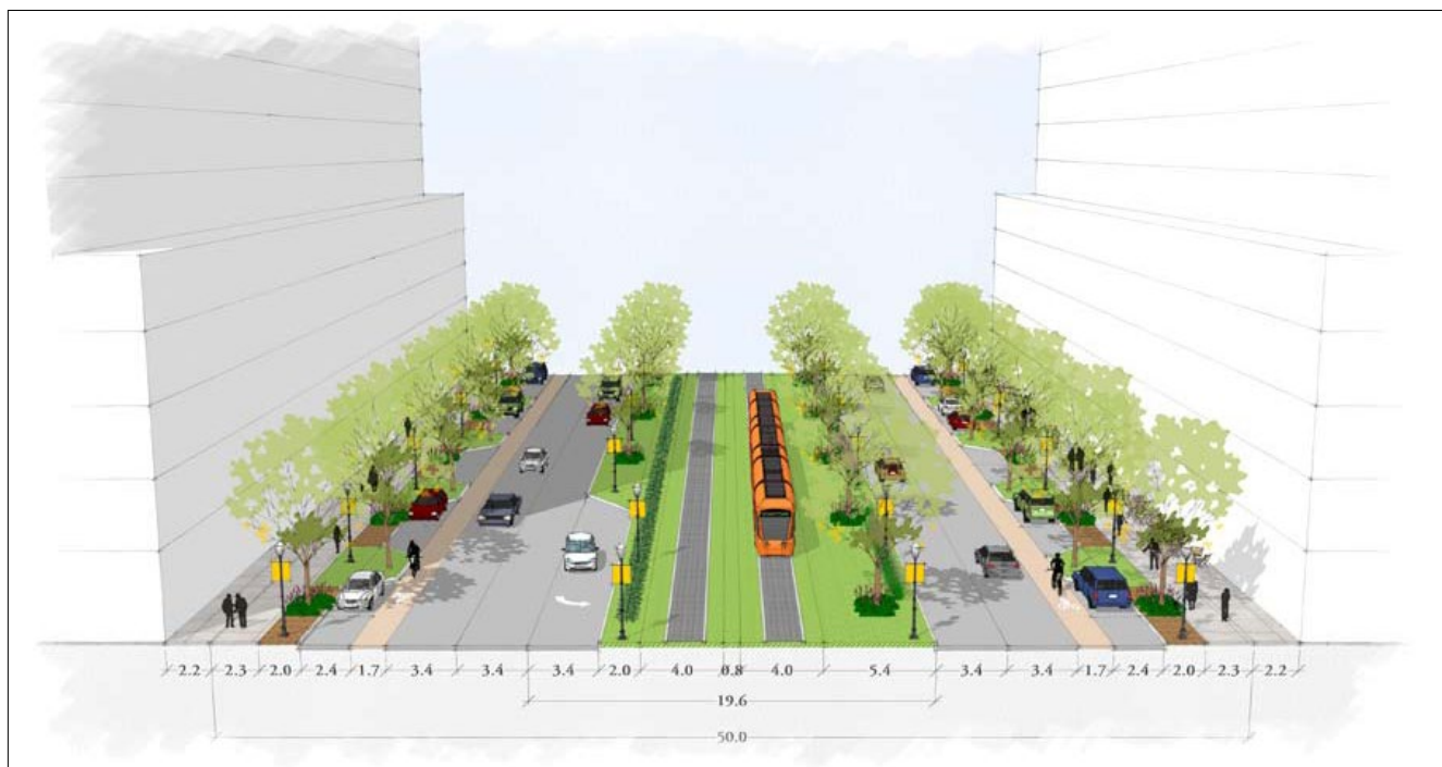
Figure 8-2: Higher order transit is proposed along Hurontario Street and will complement intensification. The illustration shows the City's vision for higher order transit along Hurontario Street.

While arterial roads will continue to move large volumes of traffic, the design of these thoroughfares must be sensitive to surrounding land uses. Arterial roads in employment areas will continue to prioritize goods movement, to support the vital role the transportation system plays in the economic health of the city. This will contrast with transportation priorities in Intensification Areas, where the needs of transit, pedestrians and cyclists will be in the forefront. In Intensification Areas, transportation decisions will support the creation of a fine grain street pattern, low traffic speeds, a mix of travel modes and attention to the design of the public realm.