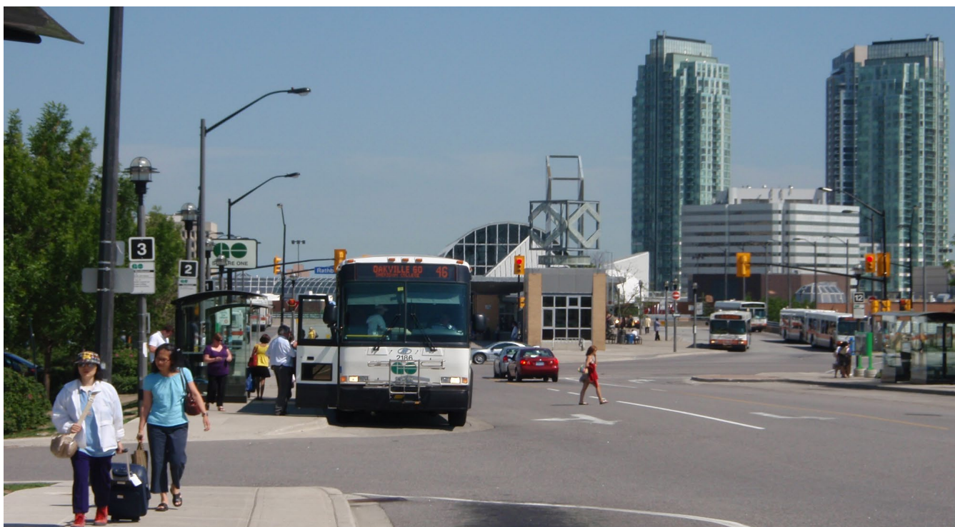
Figure 8-9: The Downtown Core Mobility Hub is an example of where people can live, work, shop and recreate in a mixed use environment supported by transit.