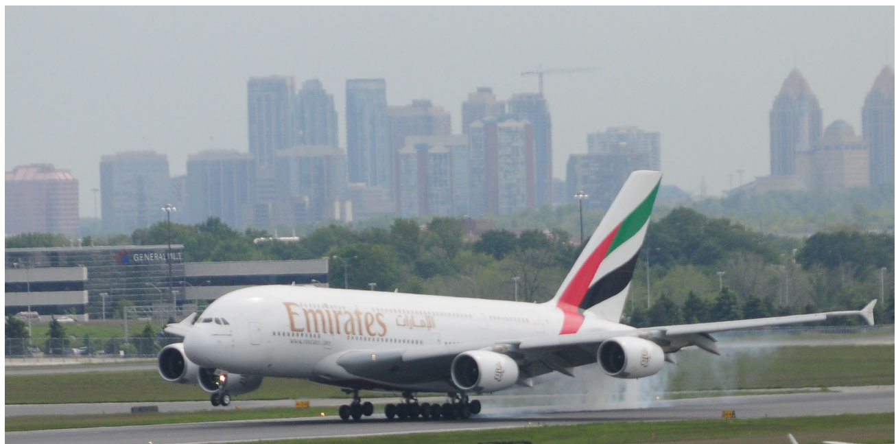
Figure 8-12: The Airport supports the local and regional economy and is a significant component in the city's transportation network.

8.9.2 Mississauga will support goods movement access to the Airport to promote the Airport as a key goods movement hub.