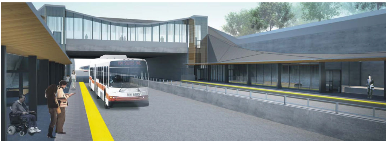
Figure 8-4: Higher order transit such as the Highway 403/Eglinton Bus Rapid Transit will provide competitive alternatives to the automobile.

8.2.3.2 Mississauga will operate a network of local grid services on major roadways and local feeder routes, which are connected at key transit terminals and commuter rail stations.