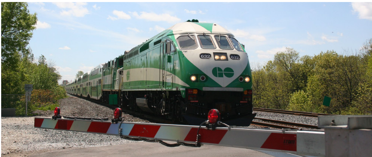
Figure 8-11: The rail corridors in Mississauga are shared by both freight and passenger trains, such as the GO train depicted above. The City recognizes these corridors as assets in the transportation system.