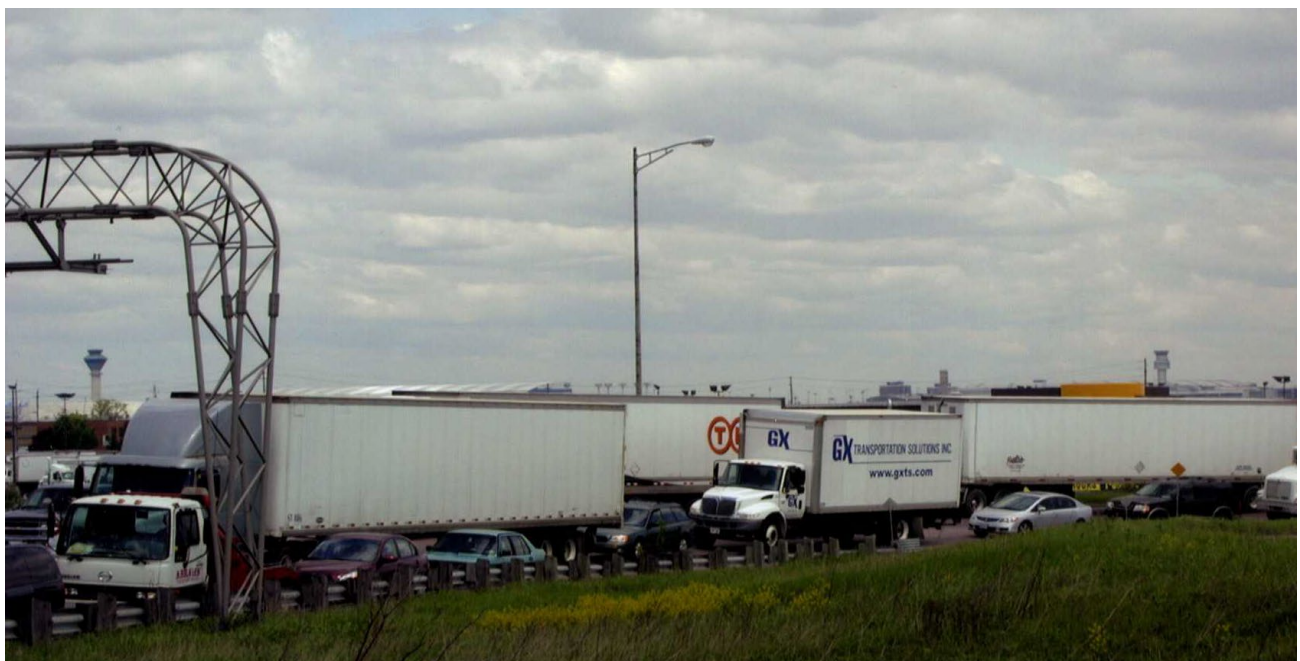
Figure 8-10: Several 400 series highways and major roads traverse Mississauga and support the many businesses reliant on efficient goods movement.

8.7.9 To support the 400 series highways as part of the provincial goods movement network, Mississauga will work with the Province to pursue opportunities to