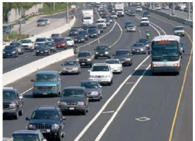
Figure 8-8: High Occupancy Vehicle (HOV) lanes such as those on Highway 403, encourage people to carpool or take transit.

8.5.3 Mississauga will encourage employers to implement TDM programs.