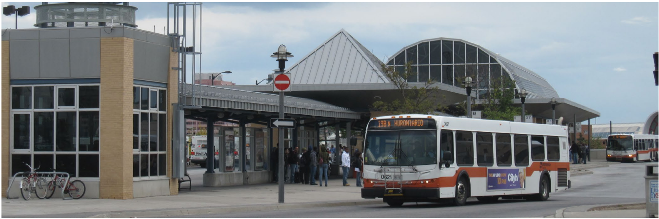
Figure 8-5: Various transportation forms exist within the city. The transit network is extensive and serves the large resident population and employment base, as well as those passing through the city.

8.2.3.3 Mississauga Transit will connect to commuter rail services operated by GO Transit that provide access to downtown Toronto and other destinations within the region.