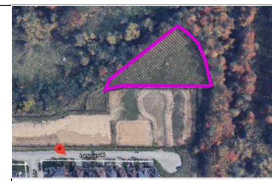
GOOGLE IMAGE OF SITE