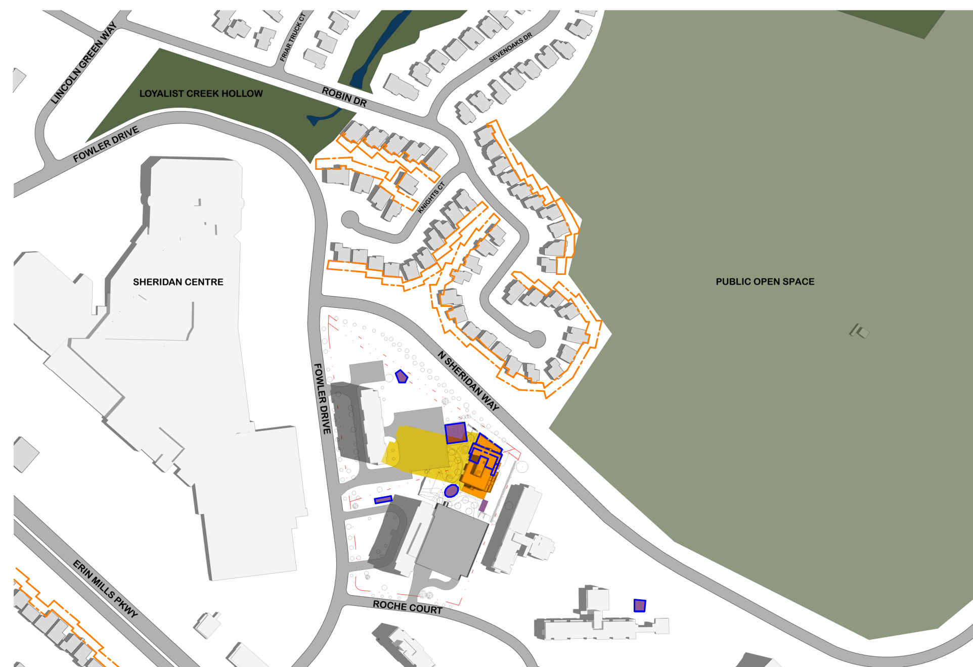
JUNE 21, 10:20