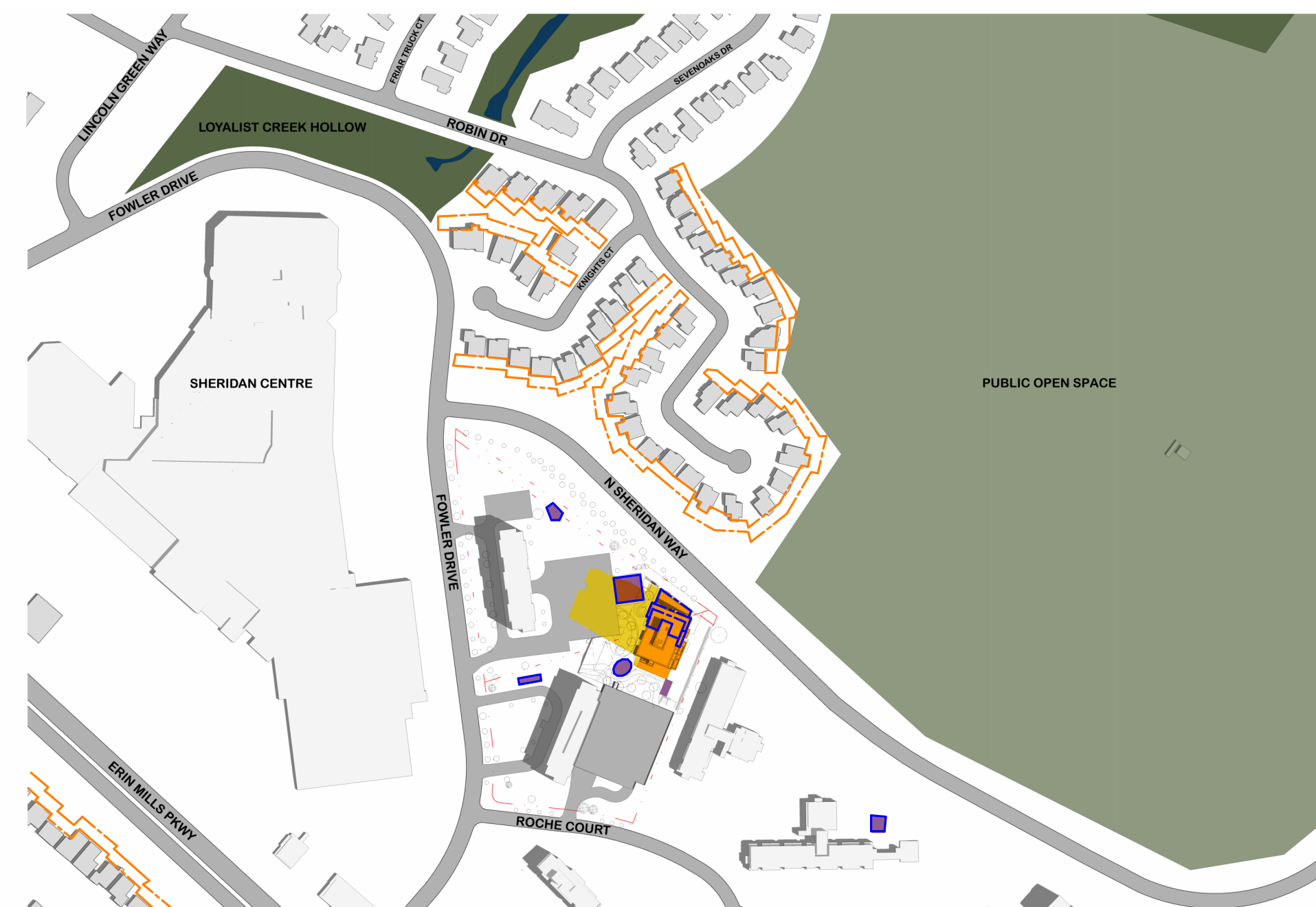
JUNE 21, 11:20