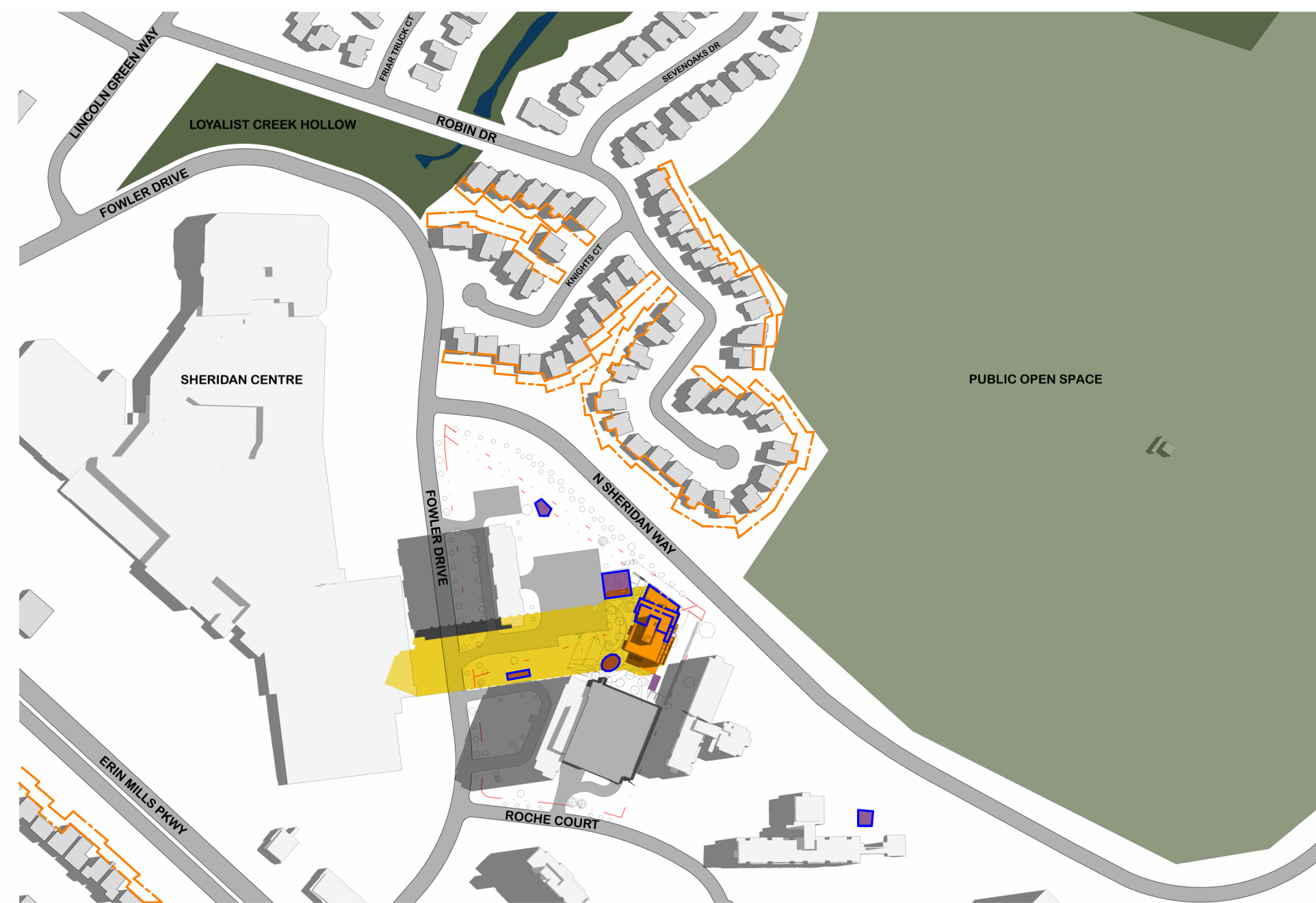
JUNE 21, 8:20