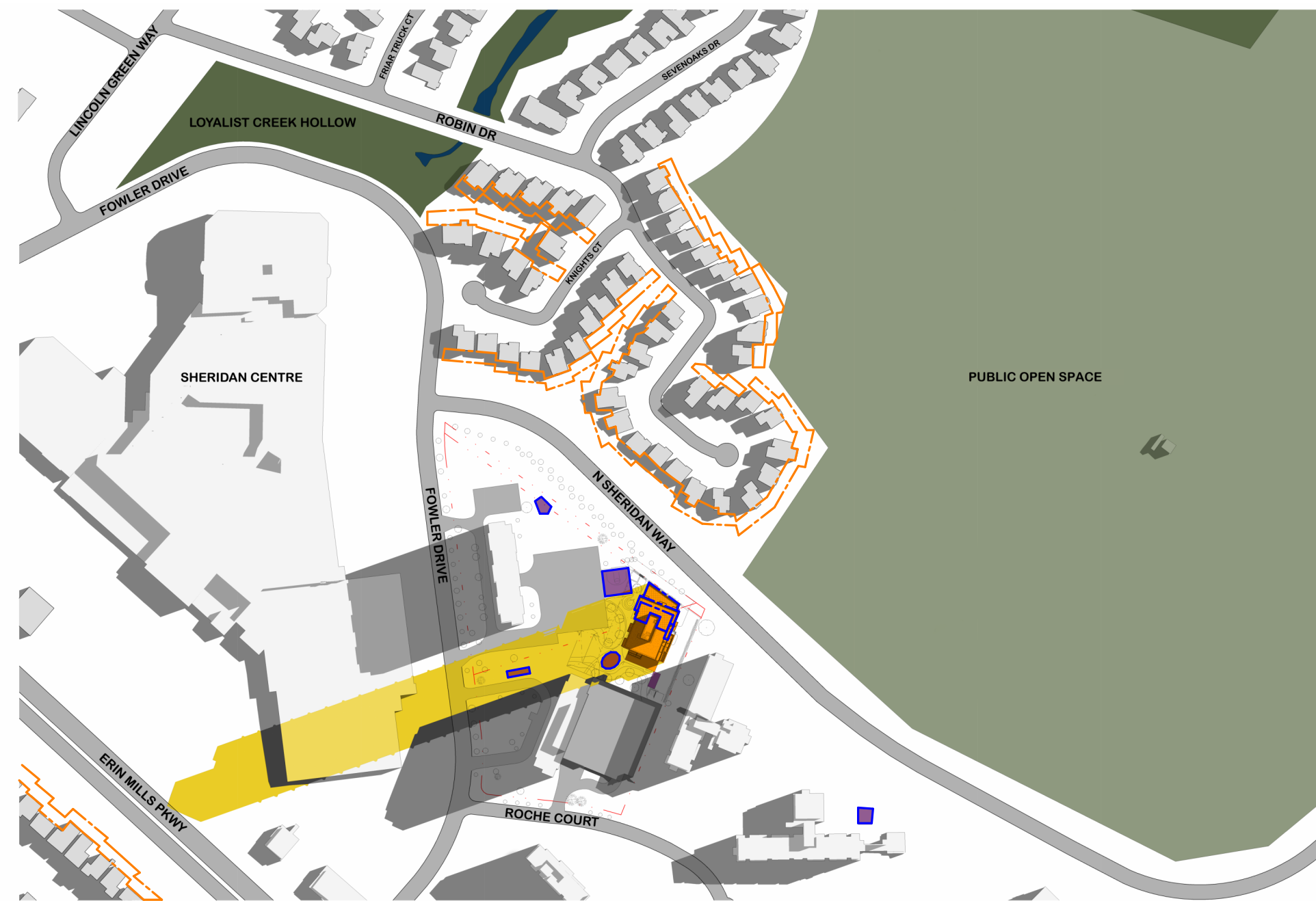
JUNE 21, 7:07