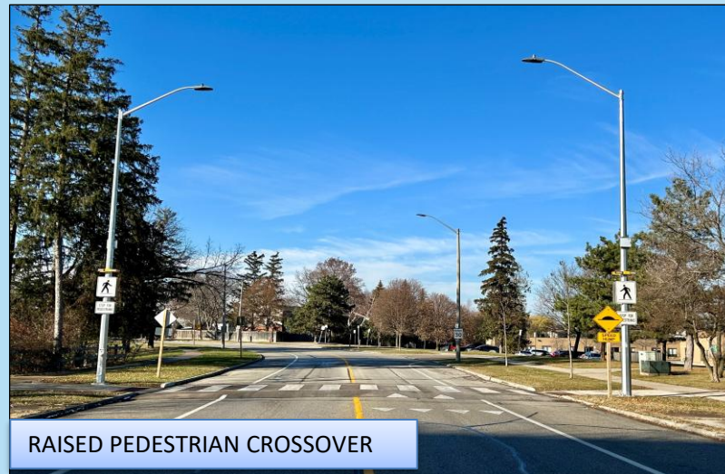
RAISED PEDESTRIAN CROSSOVER