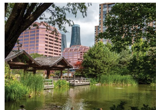
Figure 6.1. Cultural Heritage Landscapes from top to bottom: Bradley Museum, Mississauga Road Scenic Route, and Kariya Park.