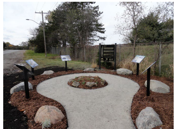
Figure 6.2. The Sacred Garden (Chi-twaa Tigannes) is a commemorative garden to honour the Mississaugas of the Credit River circa 1826-1847, the Mississaugas of the New Credit First Nation and the Credit Mission Village.

6.4.1 All archaeological assessments within the City will require engagement with First Nations and Indigenous communities who have Treaty and traditional territory across the City.