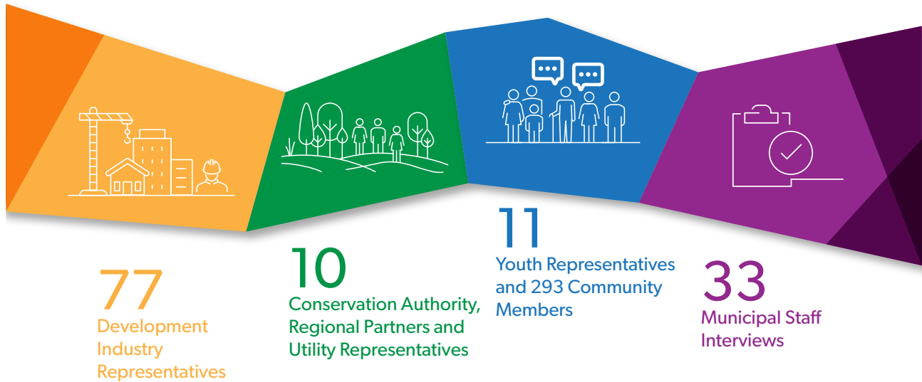
Figure 1. Summary of interested and affected parties engaged throughout the GDS project.

In addition to addressing feedback from the interested and affected parties, the GDS was developed to meet the following priorities: