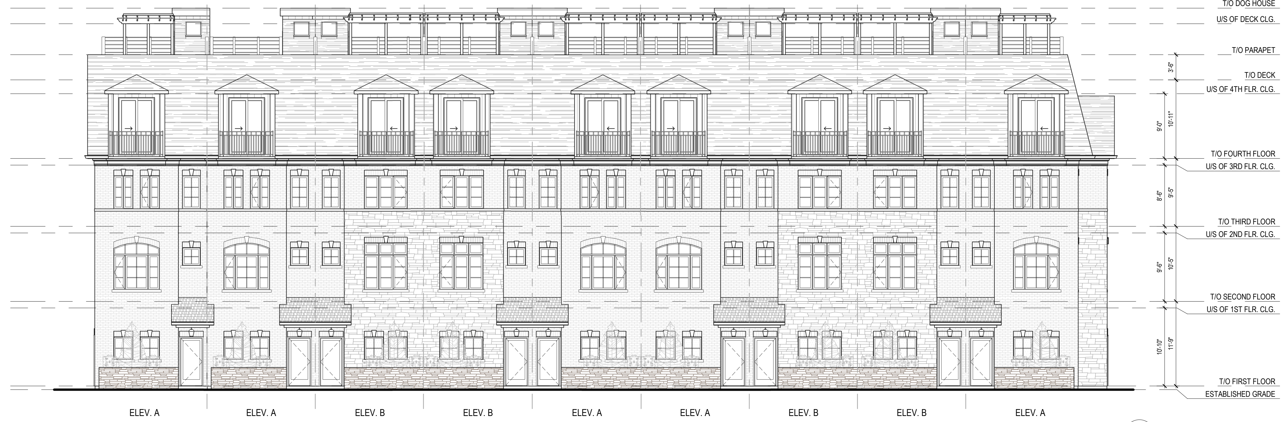
1 NORTH ELEVATION SCALE: 1/8" = 1'-0"