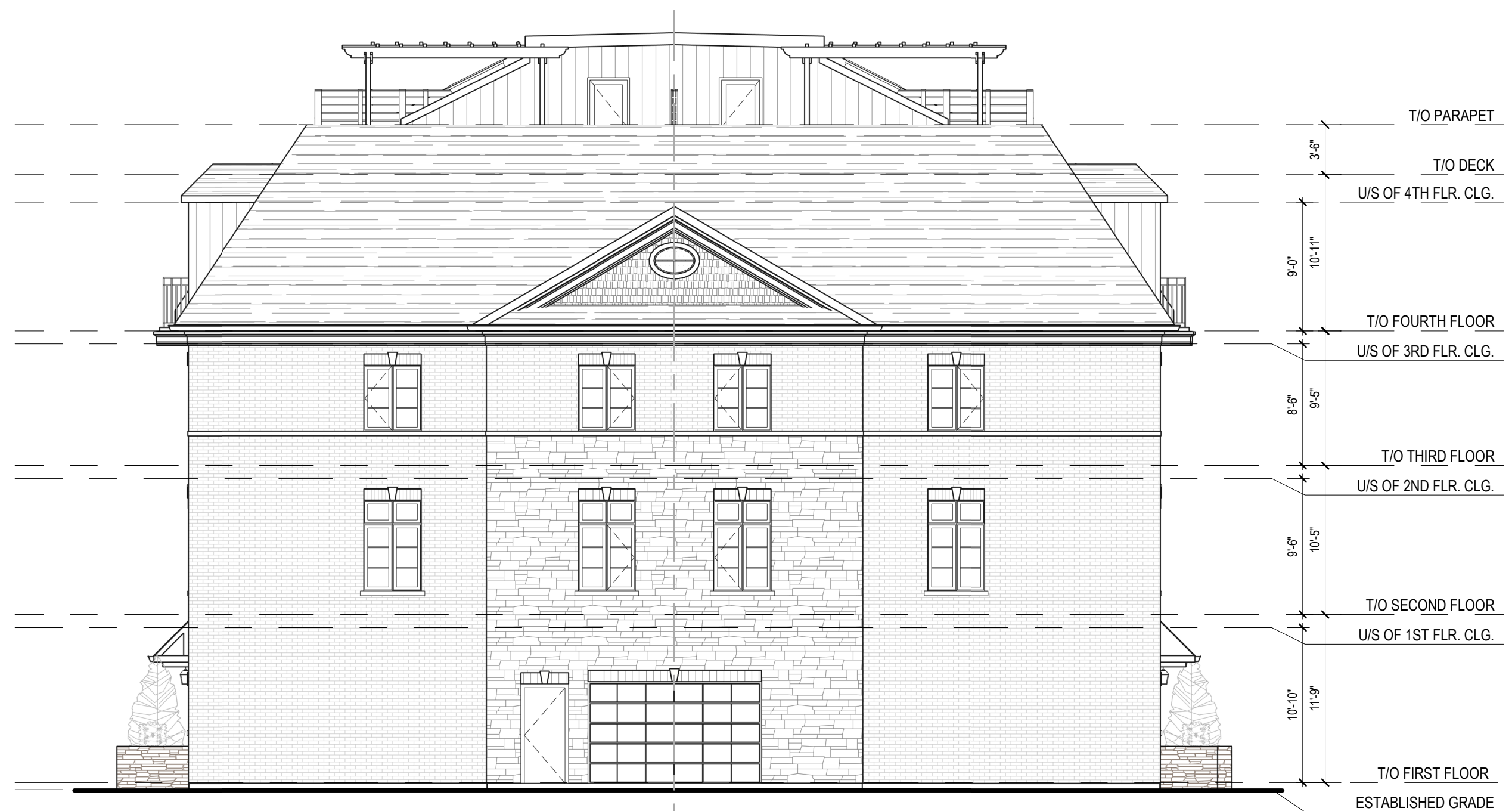
3 WEST ELEVATION SCALE: 1/8" = 1'-0"