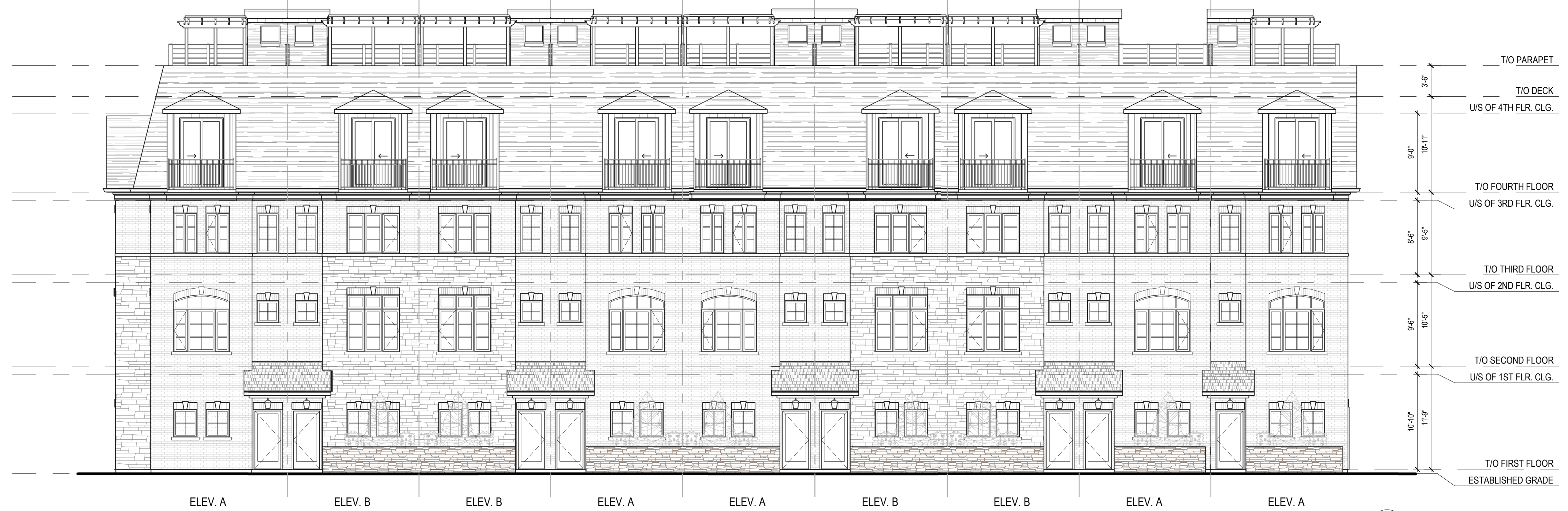
4 SOUTH ELEVATION SCALE: 1/8" = 1'-0"