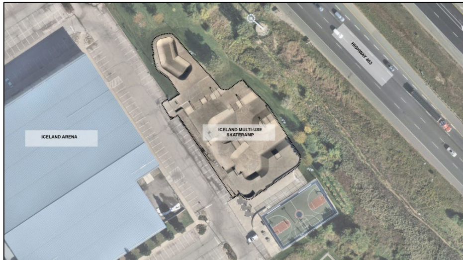
Figure 1. Aerial Image of Iceland Multi-Use Skatepark

Iceland Arena and Sports Park is located in Ward 5, at the southwest intersection of Matheson Boulevard East and Highway 403. It includes a skateboarding and BMX facility that serves users from across the City (Iceland Multi-Use Skatepark). The Iceland Multi-Use Skatepark was built in 2002 and is approximately 0.2 hectares (0.5 acres) in size excluding the seating area, with a range of terrain features such as a bowl, stairs, rails and blocks. The Iceland Multi-Use Skatepark is planned to be redeveloped as a modernized facility, maintaining its existing function while improving safety and accessibility.