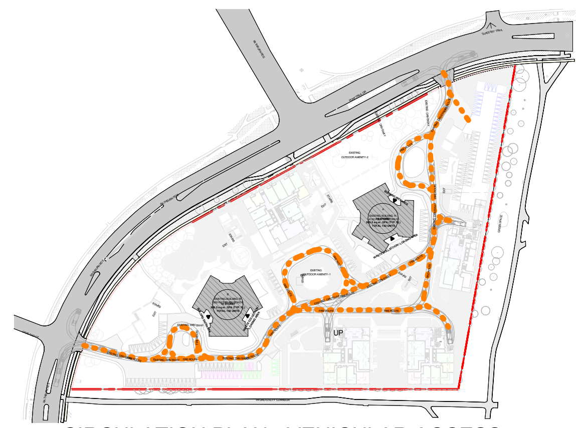
3 CIRCULATION PLAN - VEHICULAR ACCESS 1 : 2500