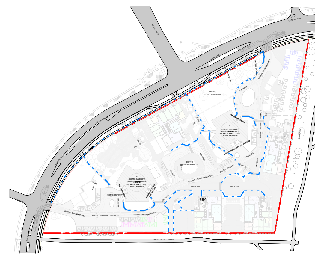
2 CIRCULATION PLAN - PEDESTRIAN ACCESS 1 : 2500