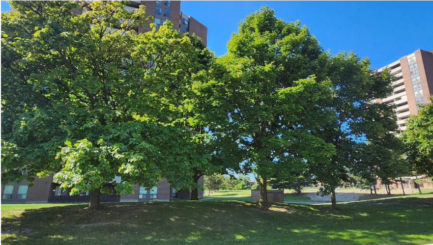
Figure 10: Trees 41 to 45.