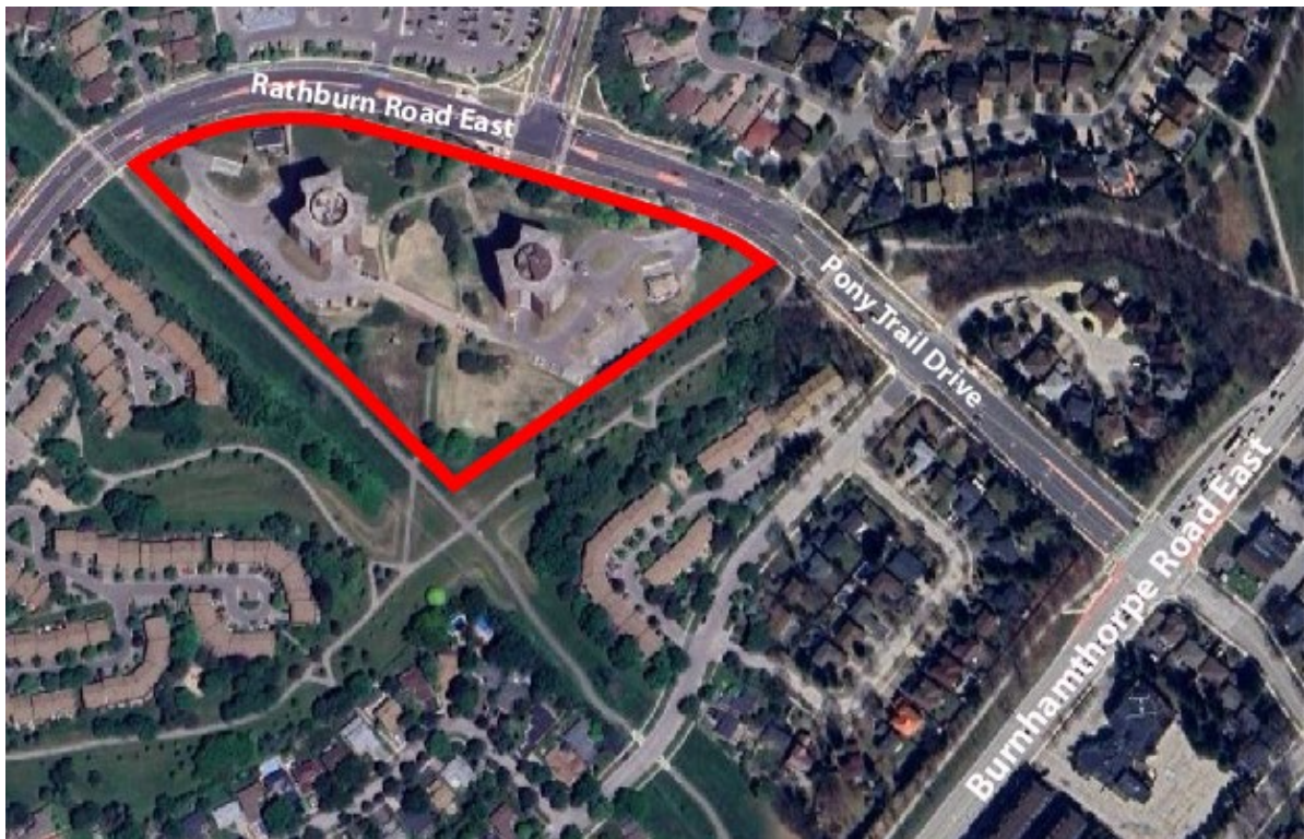
Figure 1: Context Plan.

The property owner now seeks to expand the number of units on the site with three additional residential towers and underground parking sitting along the rear of the site where there is currently only parking and lawn. This will result in additional tree removals primarily along the boundaries of the site where excavation will undermine the stability of the trees. No trees within the city right-of-way will be impacted by this additional construction, nor any trees on the adjacent properties.