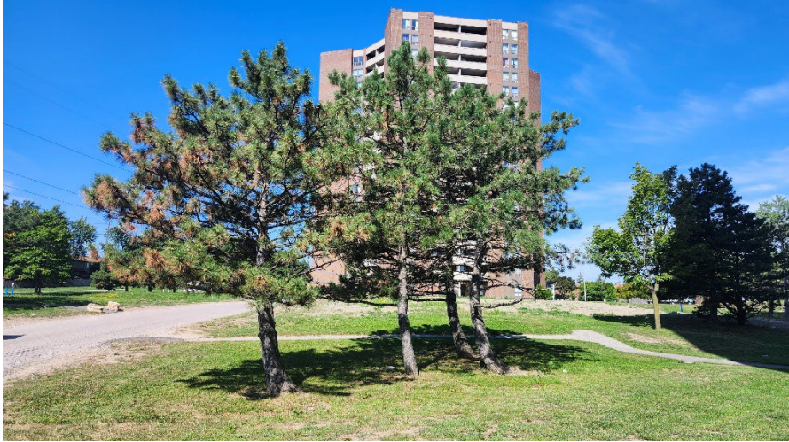
Figure 27: Trees 121 to 124.