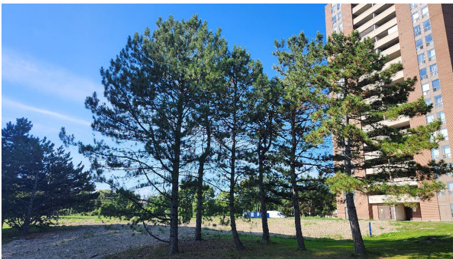
Figure 6: Trees 24 - 29.