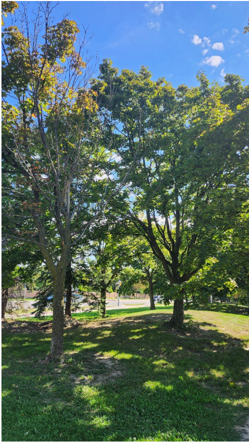
Figure 7: Trees 33 and 34.