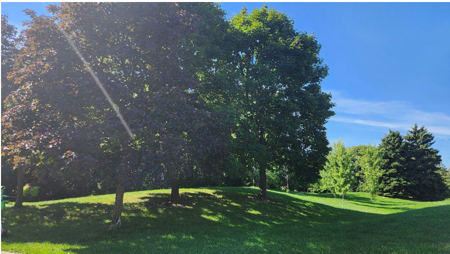
Figure 17: Trees 73 to 75 on neighbouring linear park.