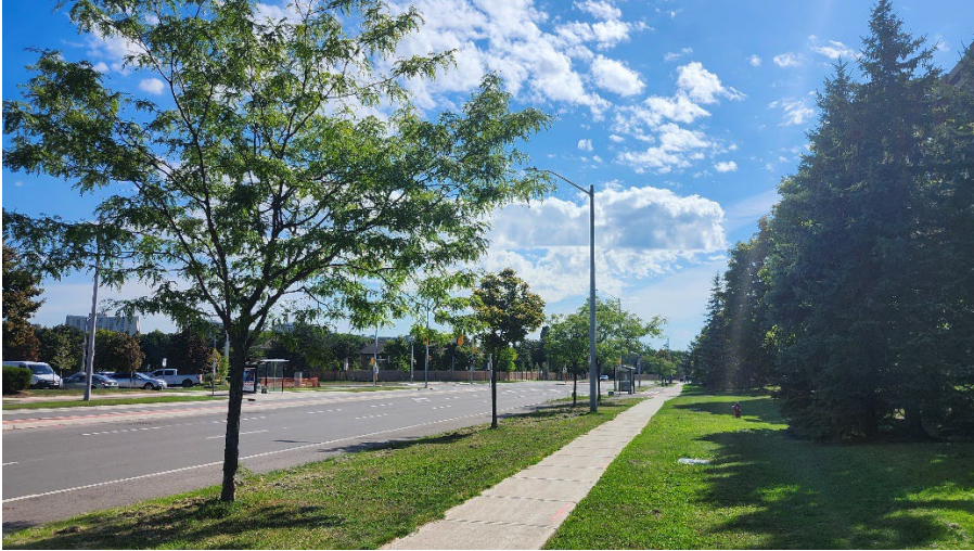
Figure 4: Boulevard trees 10 (left) to 13 (in background) and tree 14 on right.