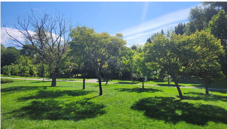
Figure 21: Trees 100 to 103 with other park tree not included in inventory in background.