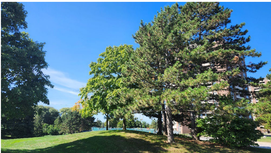
Figure 15: Tree 67 in foreground to 71 in background on left side of group.