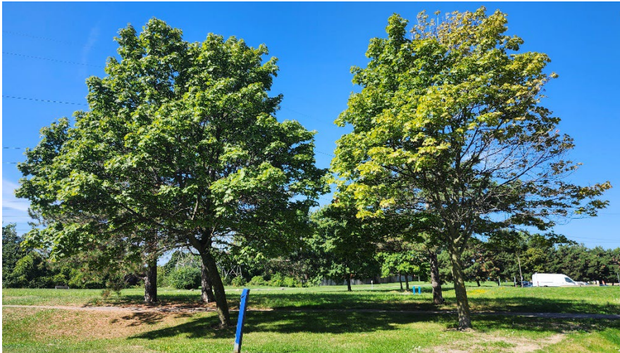
Figure 26: Trees 125 on right to 126 on left and 127-128 in background.