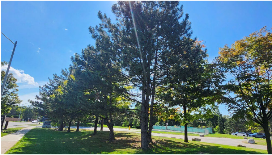
Figure 13: Trees 53 (centre) with tree 51 on right to 65 in distance.