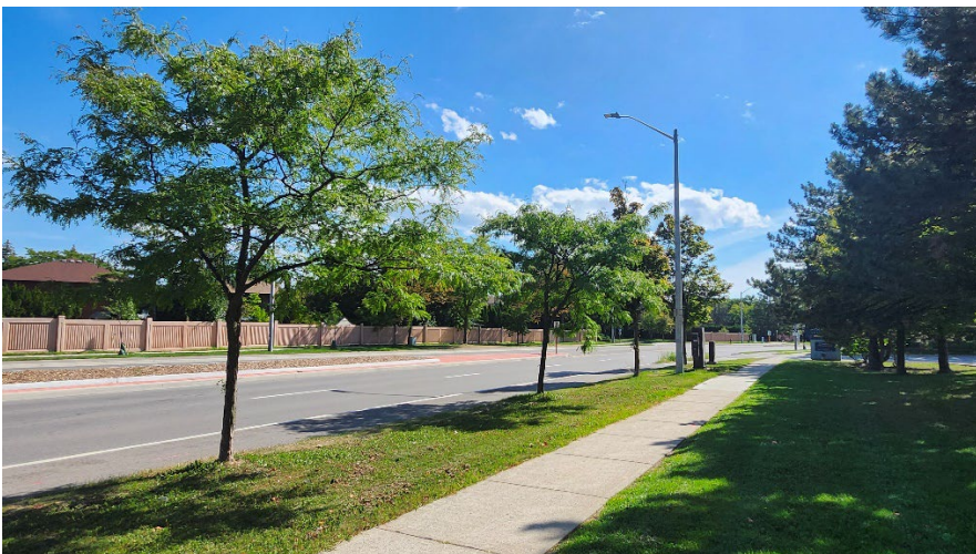
Figure 12: Boulevard trees 56 to 59.