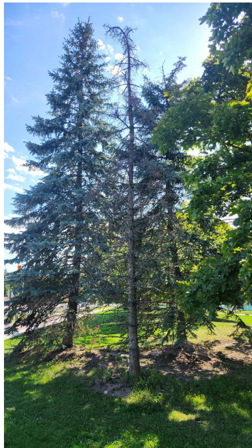
Figure 8: Trees 36 to 38.