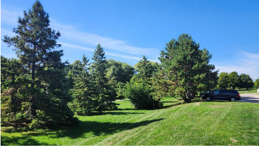
Figure 19: Trees 86 (left) to 91 on right along parking lot.