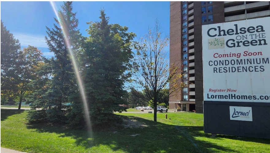
Figure 11: Conifer trees 46 to 48 and tree 49 at centre.