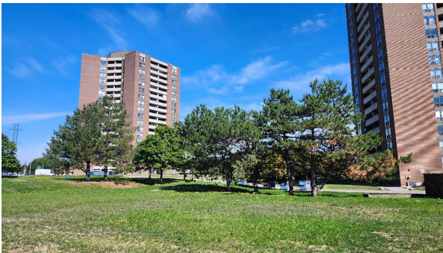
Figure 23: Trees 115 on right to 128 on left.