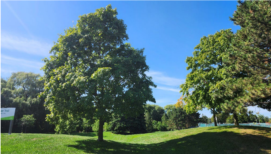
Figure 16: Tree 72.