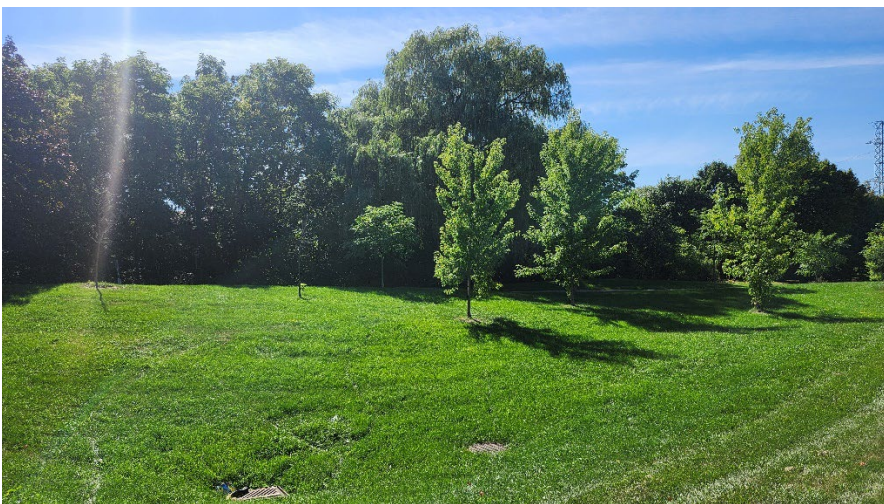
Figure 18: Trees 80 on left to tree 85 on right.