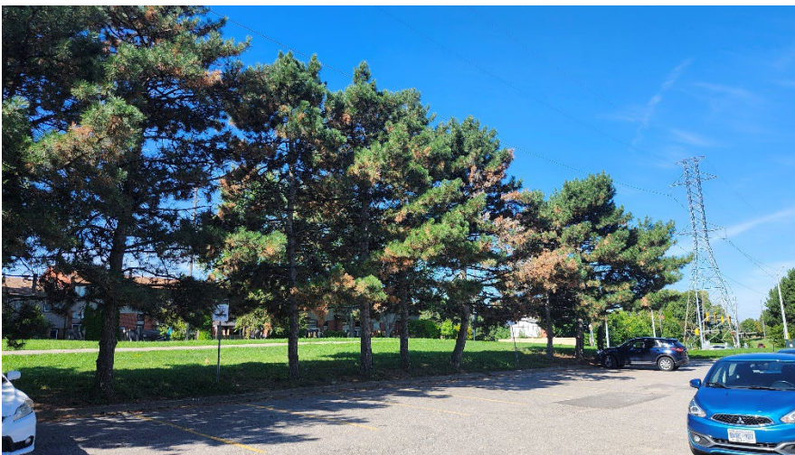
Figure 31: Trees 146 - 154.