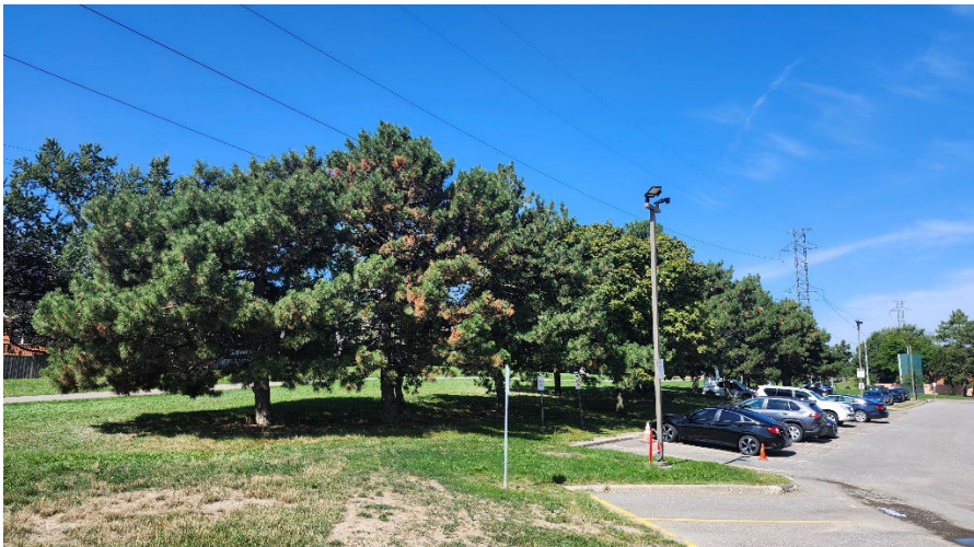
Figure 29: Trees 133 on left along parking lot.