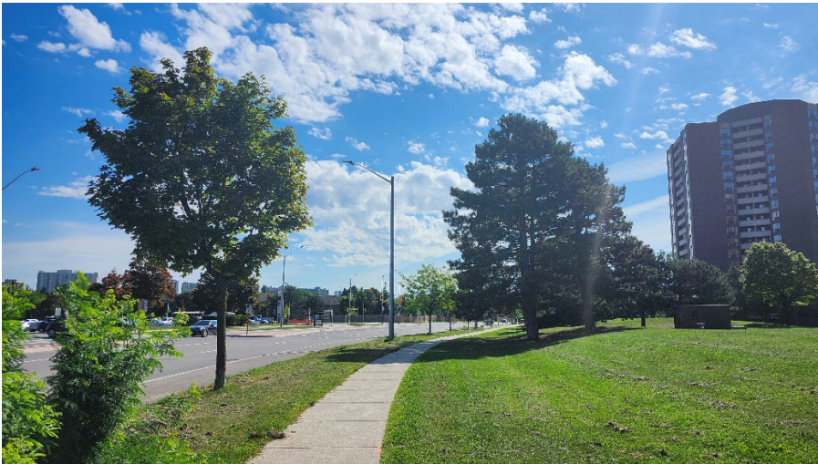
Figure 3: Trees 6 in boulevards with trees 7 to 9 in middle-ground on site.