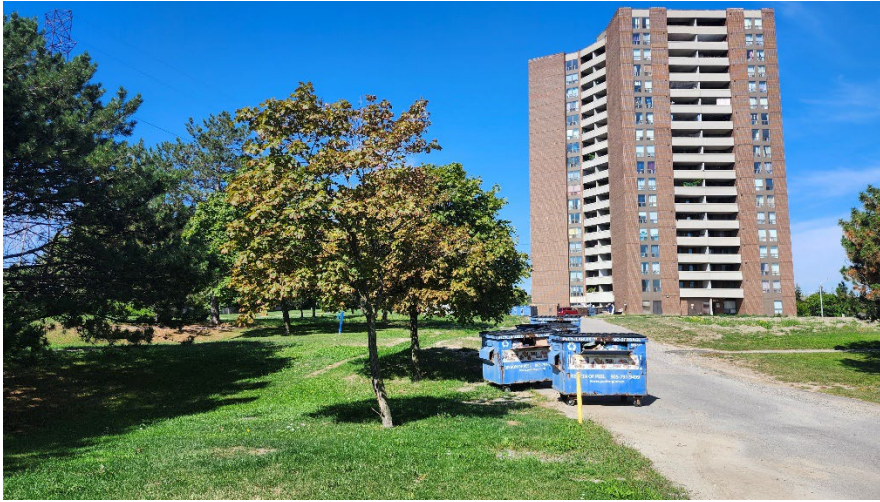
Figure 25: Trees 119 and 120 along garbage disposal bins.