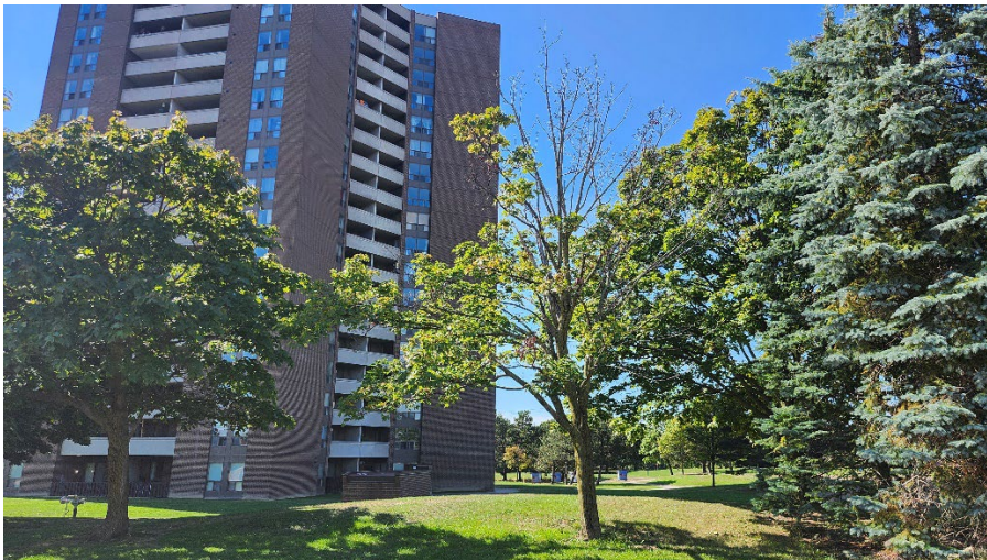
Figure 9: Trees 40 (left), 39 (centre), and 38 (right) with 35 in background.