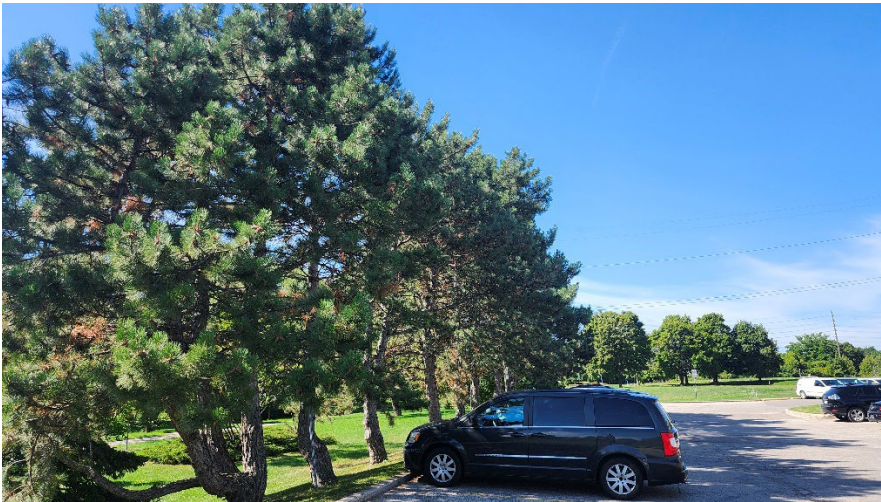
Figure 20: Tree 91 on left to 99 on end of row.