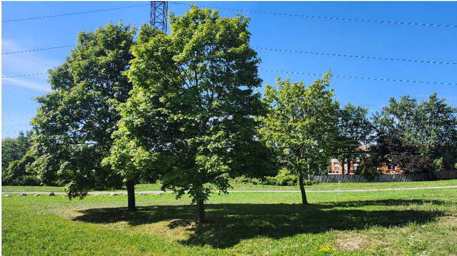
Figure 28: Trees 130 to 132.