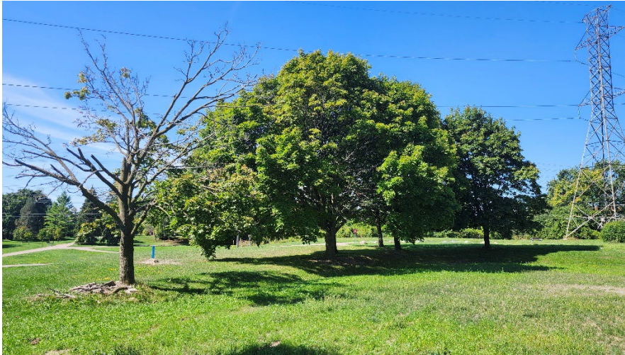
Figure 22: Tree 109 on left and trees 110 to 114 on right.