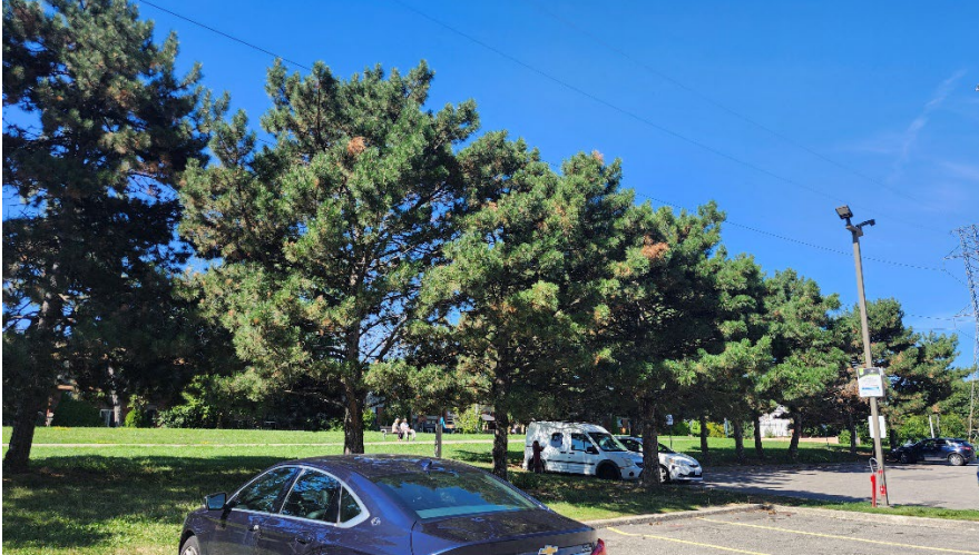
Figure 30: Neighbour's trees along south west property line to be preserved.