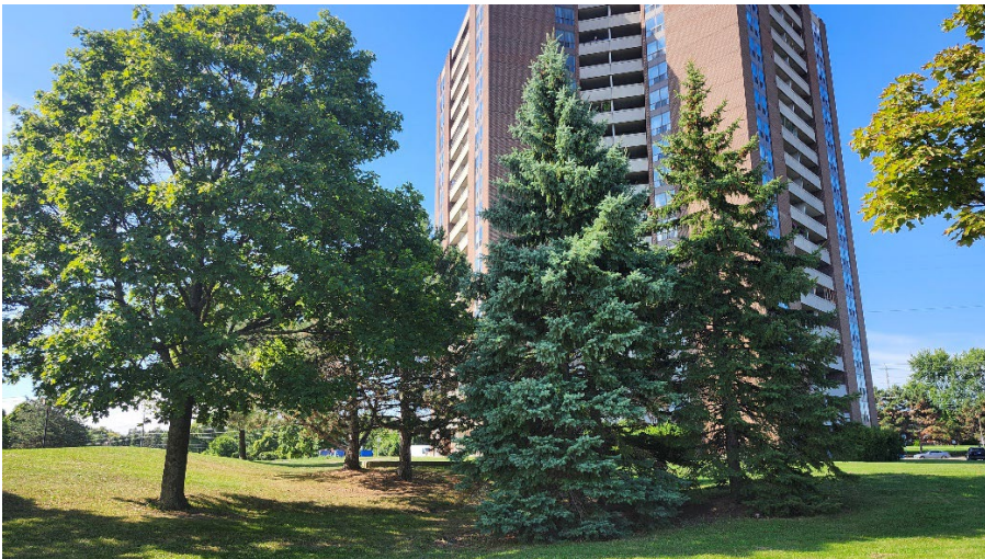
Figure 5: Tree 14 (right) to trees 19 (left) with trees 17 and 18 in background.