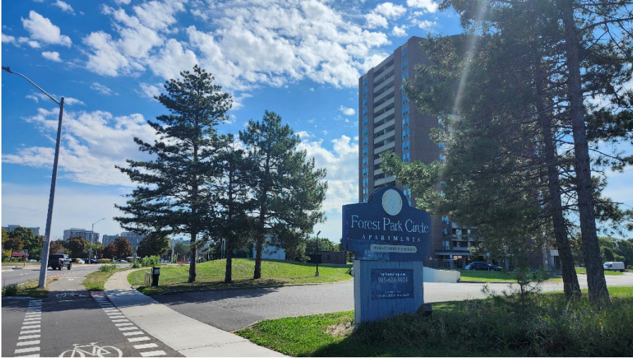
Figure 2: Trees 1 to 5 at Rathburn driveway.