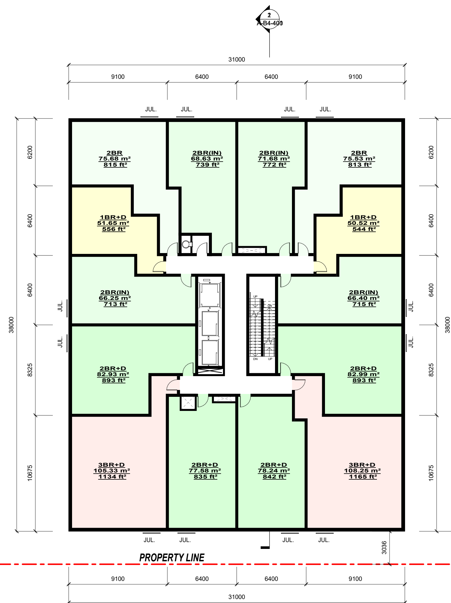
1 LEVEL 4-5 1 : 200