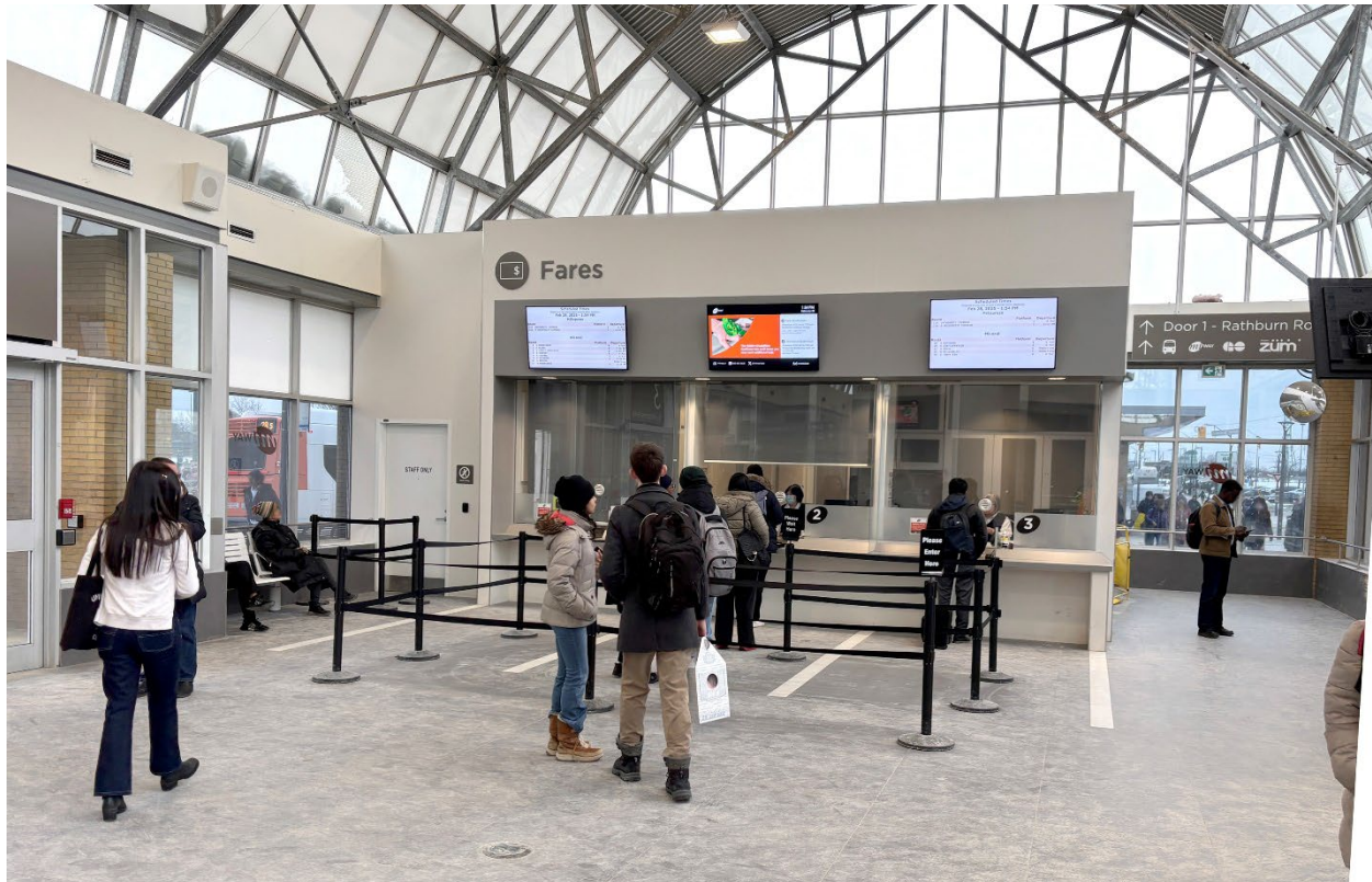
Interior photo of the City Centre Transit Terminal.

Building from this, public art will be added into the facilities to contribute to wayfinding goals by creating a strong sense of place. Artwork in this space will be high impact and viewed by many pedestrians and transit users and will enhance the commuting and travel experience by making time spent in the terminal more enjoyable and engaging. Located in the Downtown Core Culture District , public art in the terminal will enhance the identity of the Downtown Core by engaging diverse local communities in storytelling, being culturally relevant, fostering community building, and building a sense of belonging.