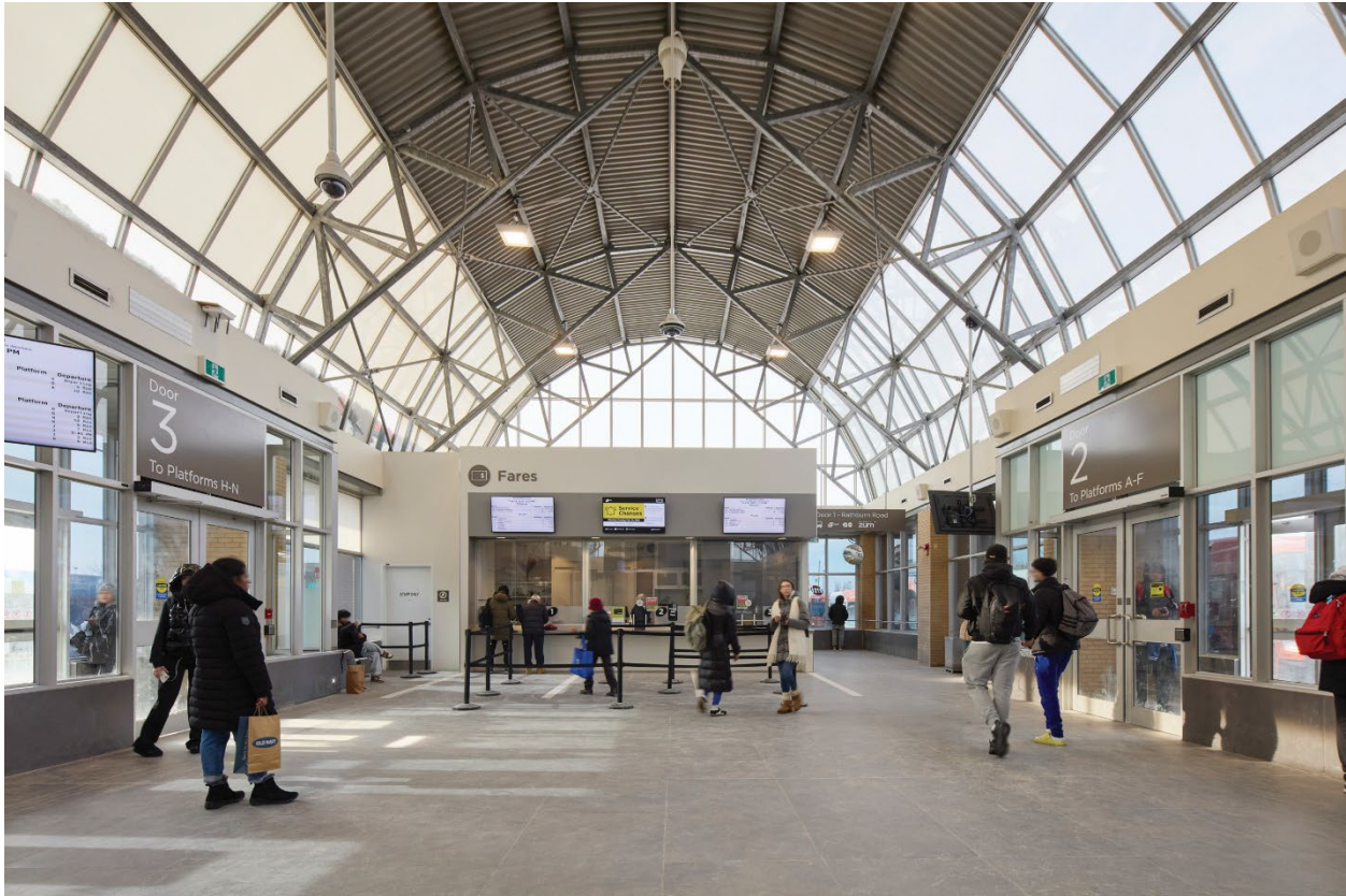
Interior photo of the City Centre Transit Terminal.

Buses use the upper level, while access from Square One is through the lower level. The upper level includes tickets sales, an information booth, and lost and found services. GO Transit's regional Square One Bus Terminal is located directly north from the transit station, across Rathburn Road, on Station Gate Road.