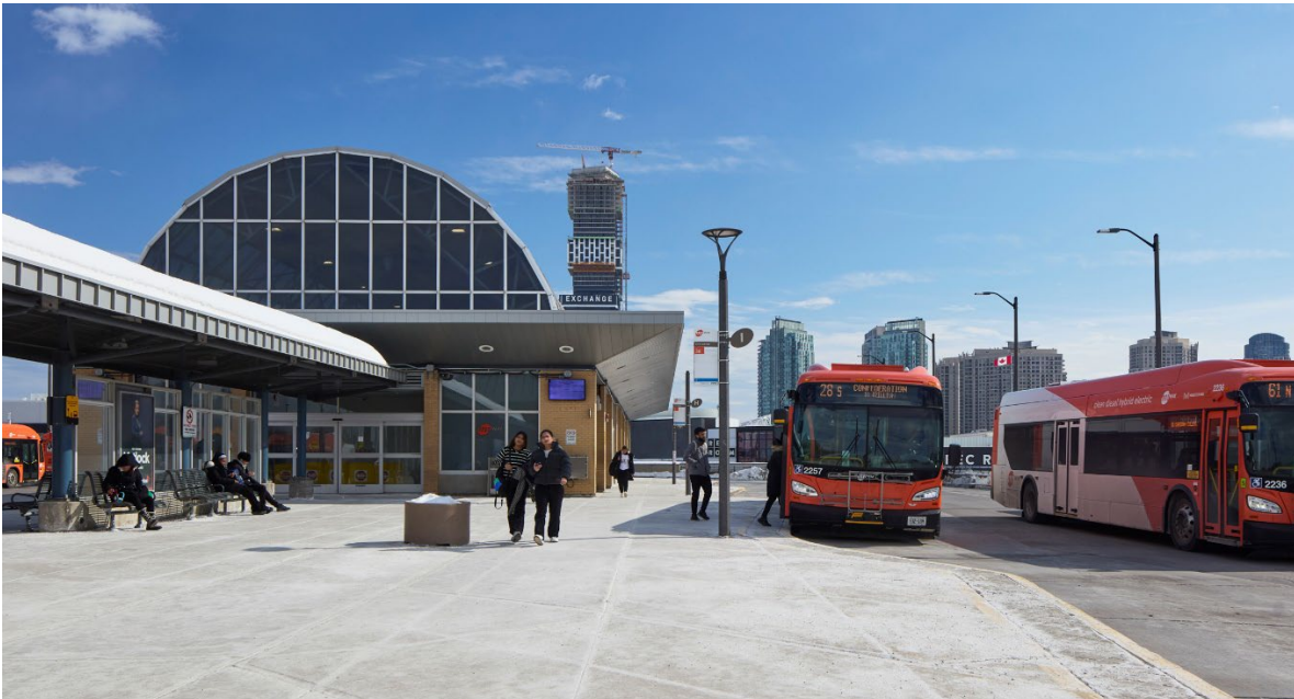
Exterior of Mississauga's City Centre Transit Terminal.

The City of Mississauga's Public Art Program seeks to commission an artist, artist team, or illustrator to create original artwork for Mississauga's City Centre Transit Terminal. The commissioned artist(s) will be expected to create two digital artwork designs, which will be printed on vinyl and installed by the City within the terminal building.