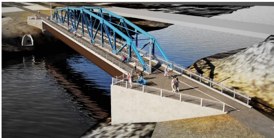
Figure 1 Rendering of the pedestrian bridge crossing over the Credit River (aerial view)

This new infrastructure project aligns with the City's goal of fostering a healthier and more accessible community by improving active transportation connections and creating safer, more convenient ways to move through the area.