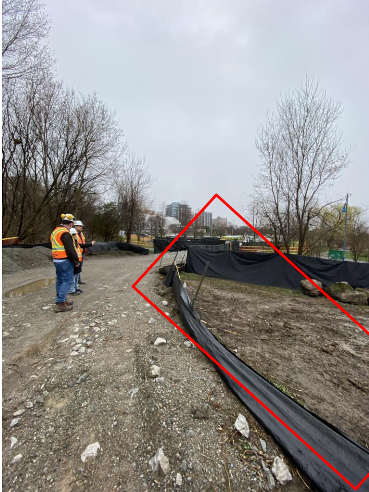
Figure 4 Photo of the proposed artwork location (as of April 16, 2026)