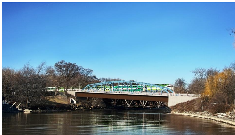
Figure 2 Rendering of the pedestrian bridge crossing over the Credit River