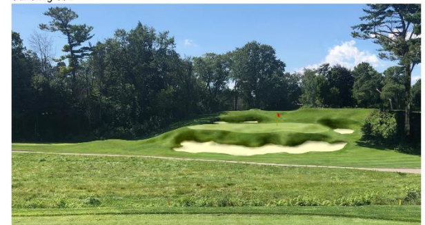
Proposed green restoration