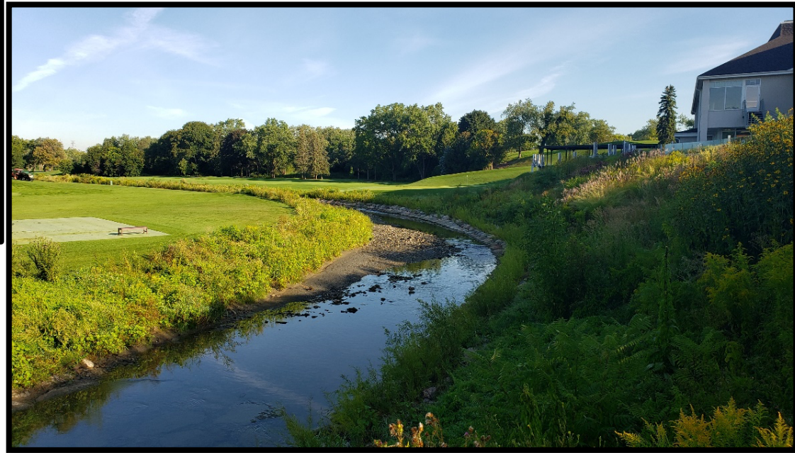
Proposed creek concept