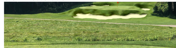
Proposed green restoration